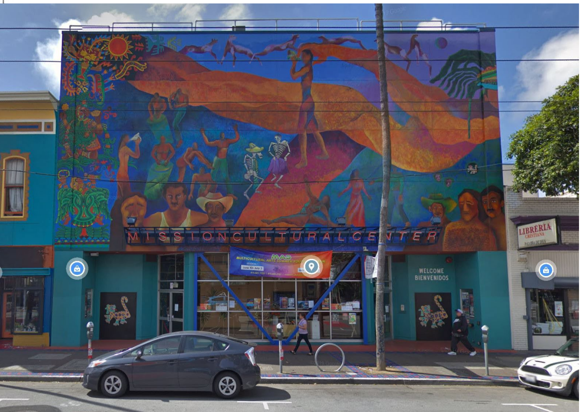
Mission Cultural Center for Latino Arts Building, 2868 Mission Street