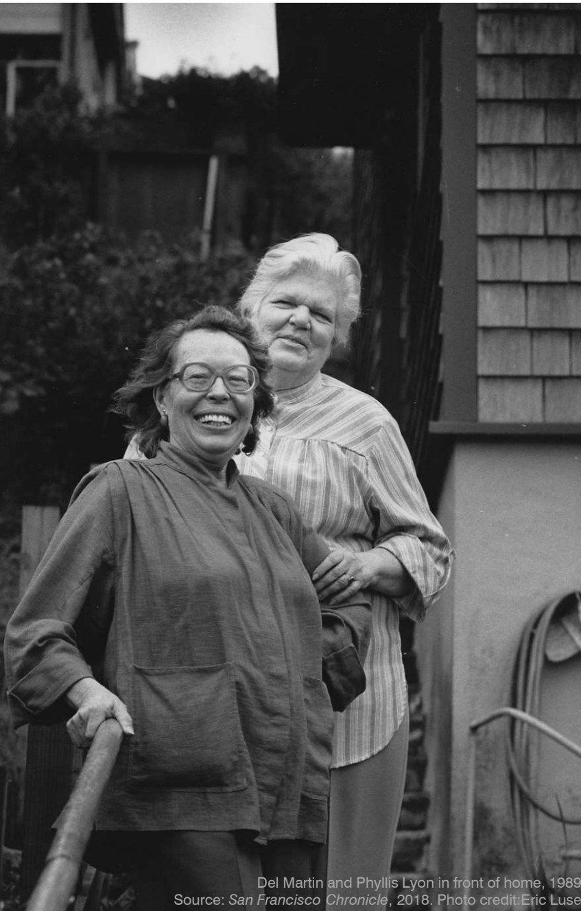
Del Martin and Phyllis Lyon in front of home, 1989