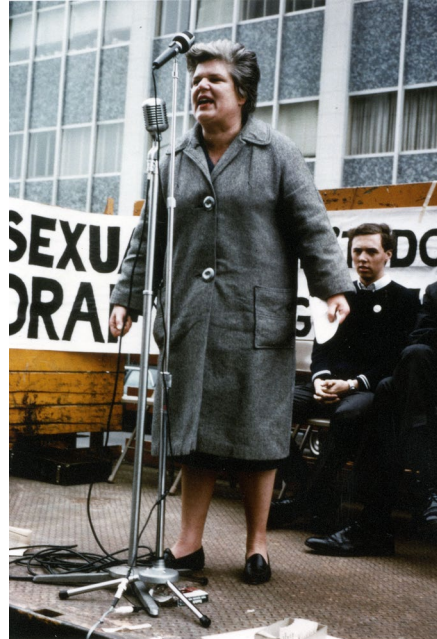
Speaking at protest on gay exclusion from military, 1966