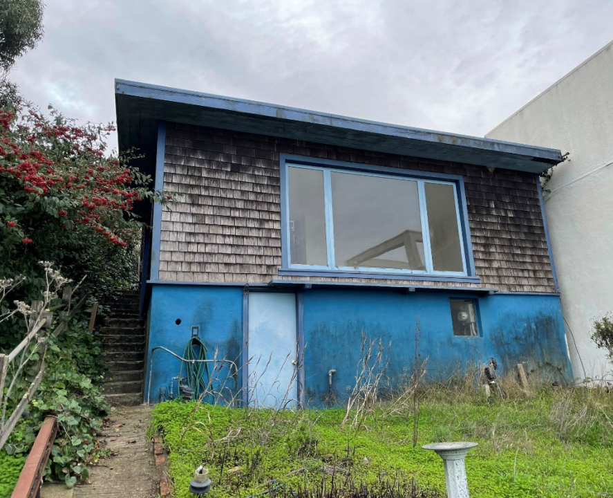
651 DUNCAN STREET, 2020. TOP: FRONT FAÇADE AND STAIRS LEADING TO SIDE ENTRY. BOTTOM: LIVING ROOM.