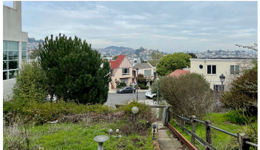
649-651 DUNCAN STREET, 2020