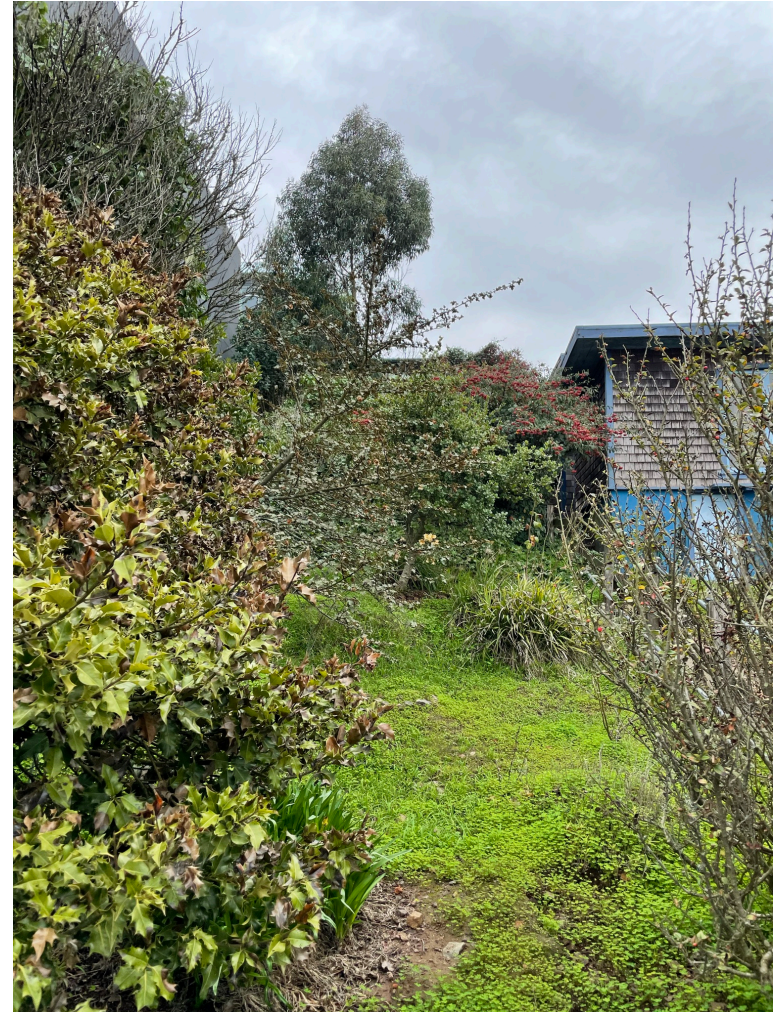
649 DUNCAN STREET, 2020