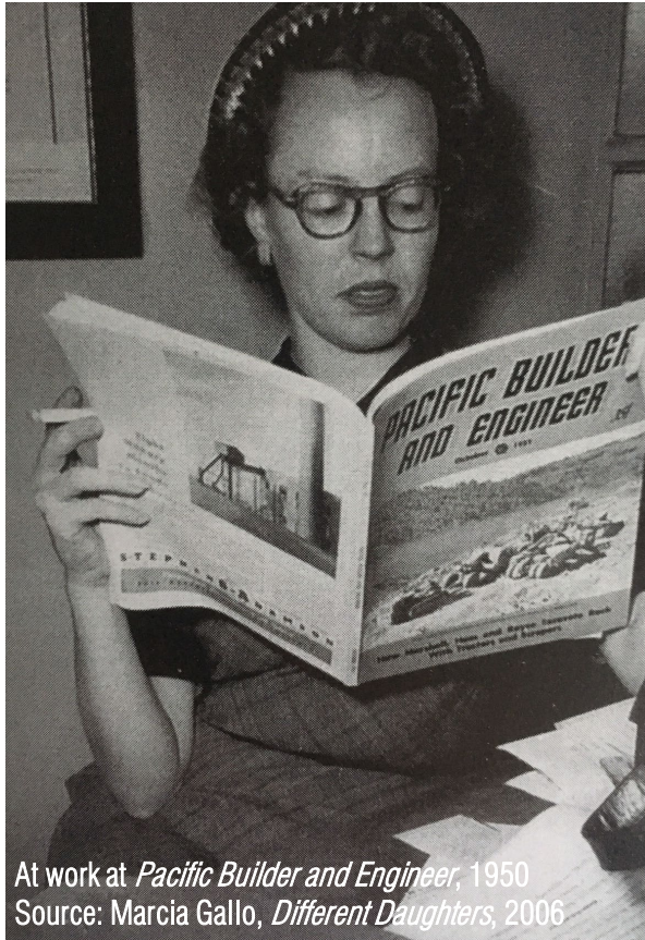
At work at Pacific Builder and Engineer, 1950