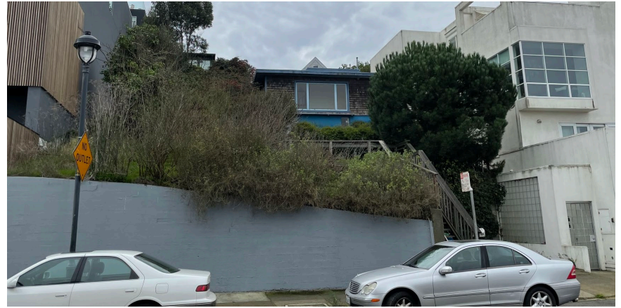
649-651 DUNCAN STREET, 2020