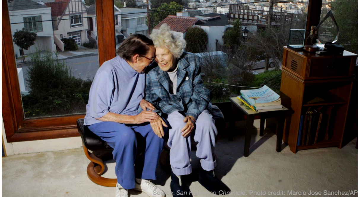
Source: San Francisco Chronicle.