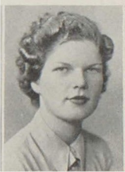
George Washington High School Yearbook, 1937