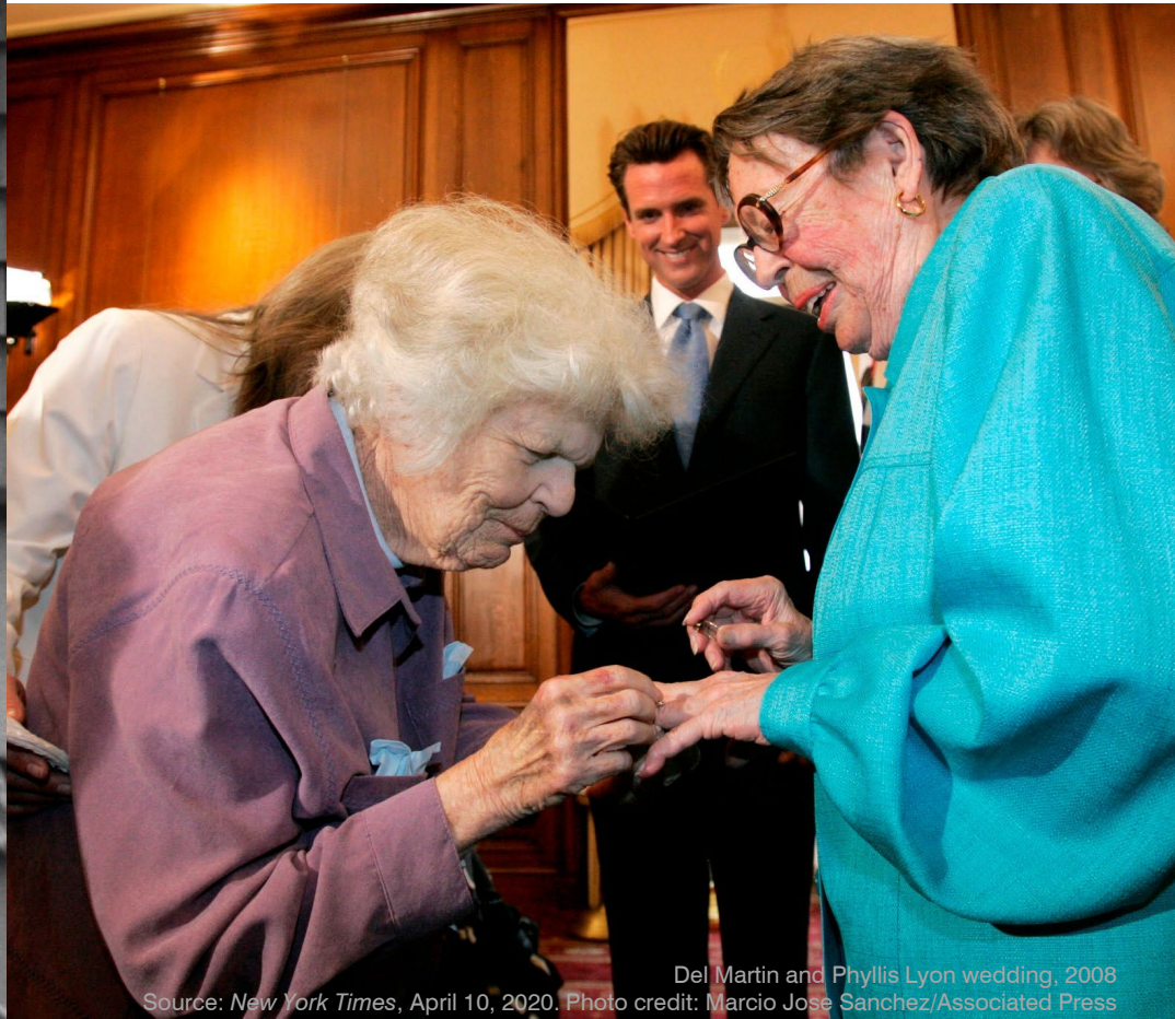
Del Martin and Phyllis Lyon wedding, 2008 Source: New York Times, April 10, 2020.