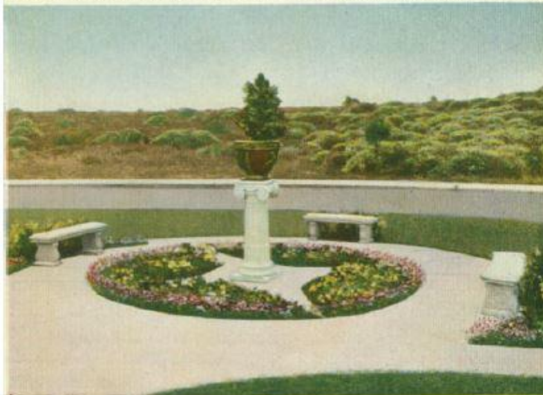
IONIC COLUMN, upon which is represented Youth, Summer and Noon. Then you reach meridian and the