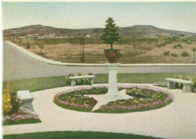
TUSCAN COLUMN, last of the classic orders, upon which is represented Old Age, Winter, and Night.