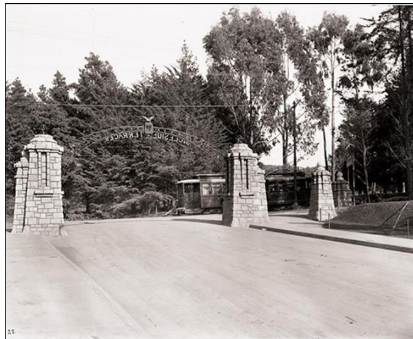
right: c. 1912-1915, top: SFP22-0125, bottom: SFP22-0128