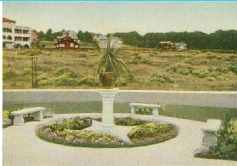
CORINTHIAN COLUMN, upon which is inscribed Manhood, Autumn, and Afternoon, then pass on to the