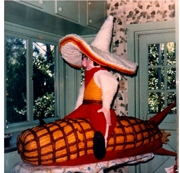
"Jimmy the Cornman" piñata