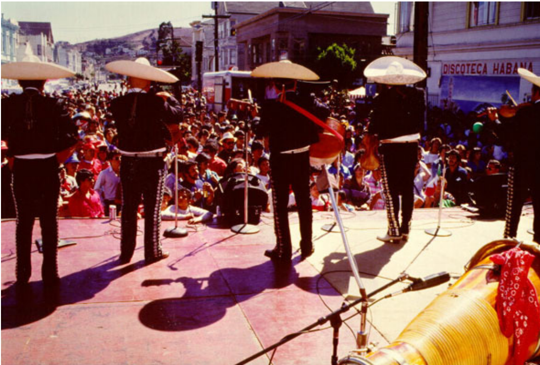
Mariachi band at 24 th Street Festival