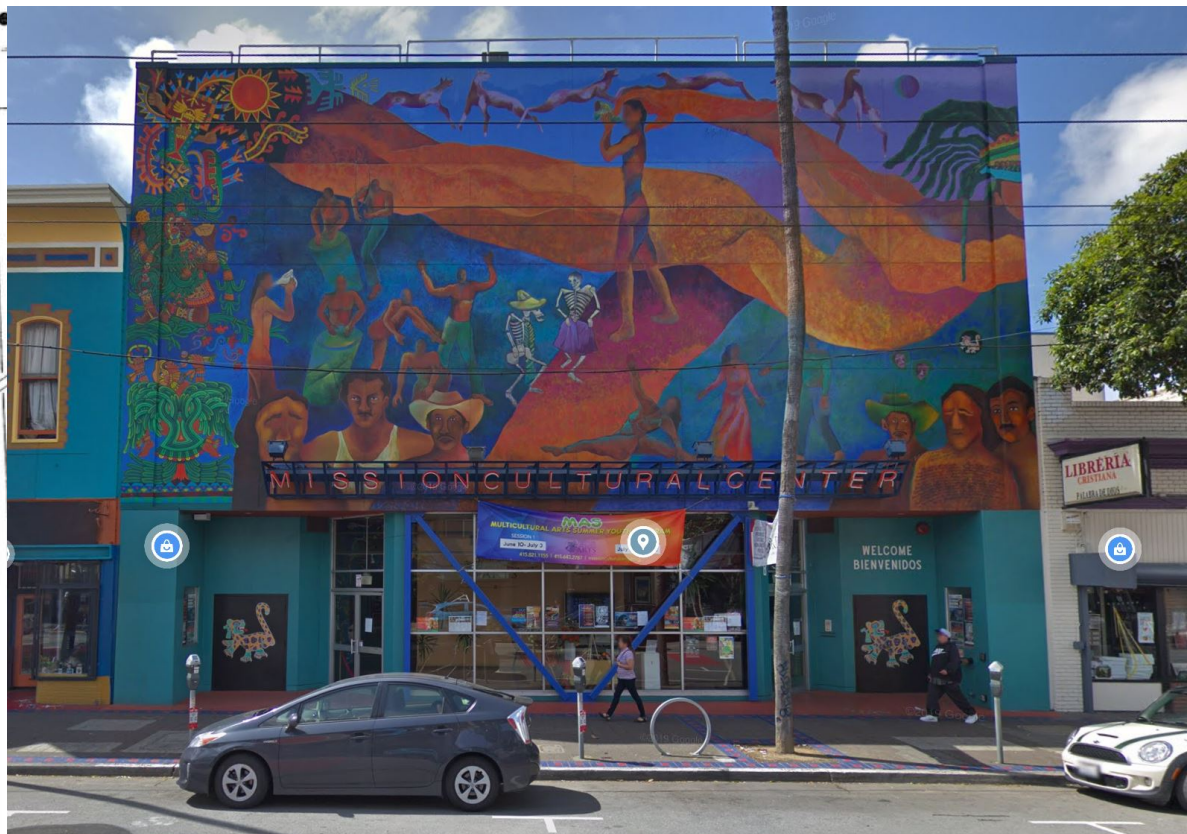
Mission Cultural Center for Latino Arts Building, 2868 Mission Street