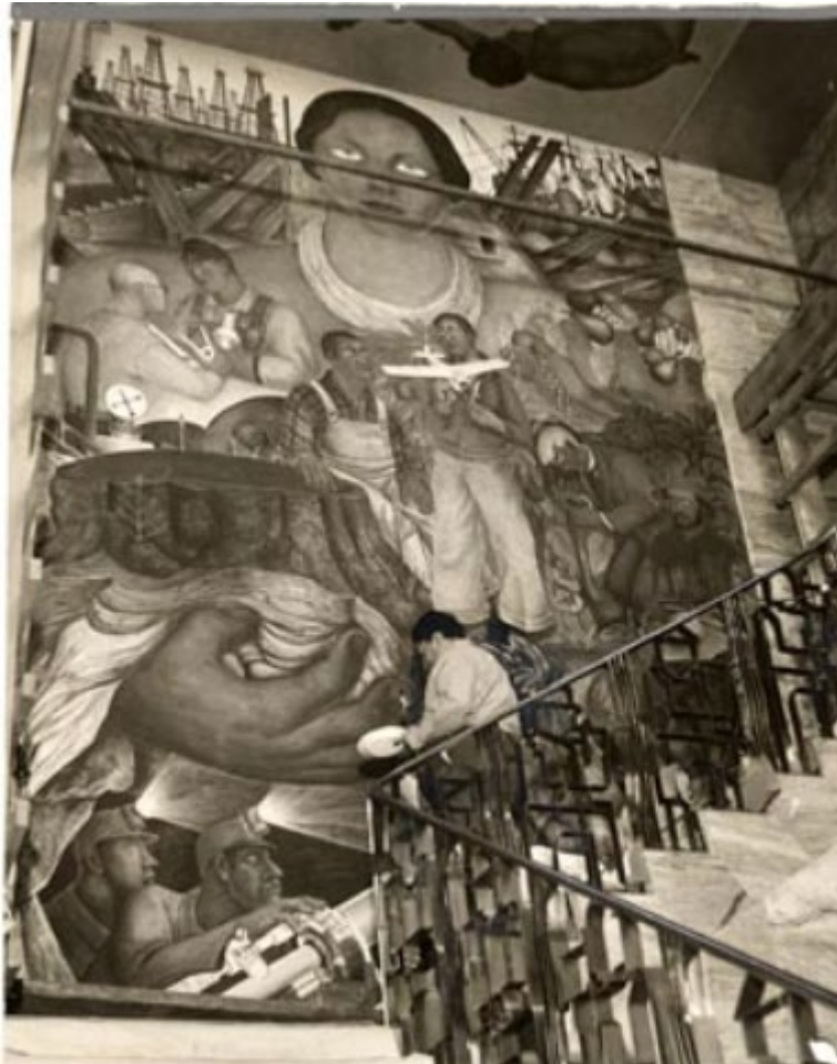
Diego Rivera putting finishing touches on fresco decorating wall of Stock Exchange, February 27, 1931.