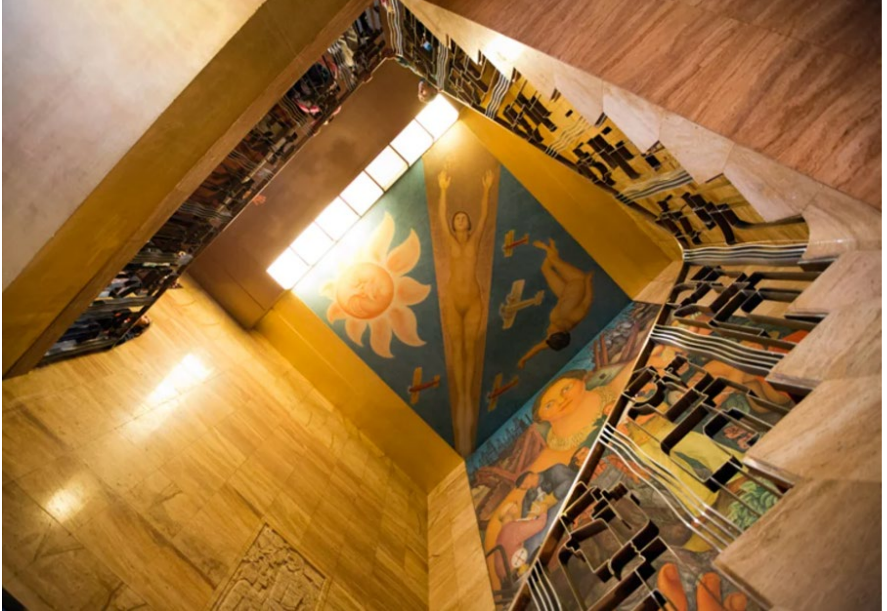
Allegory of California (Diego Rivera, 1931).