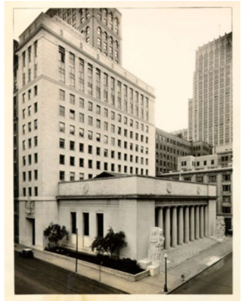
Stock Exchange Building and Stock Exchange Tower, 1936.