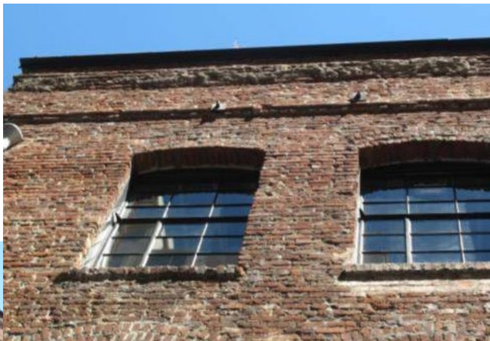
Above: Detail of windows and damaged brick corbelling at Merchant Street elevation, 2017