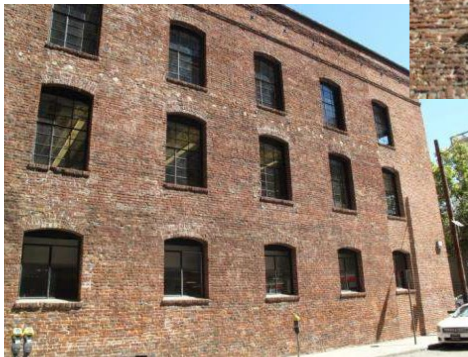
Left: Merchant Street elevation, 2017