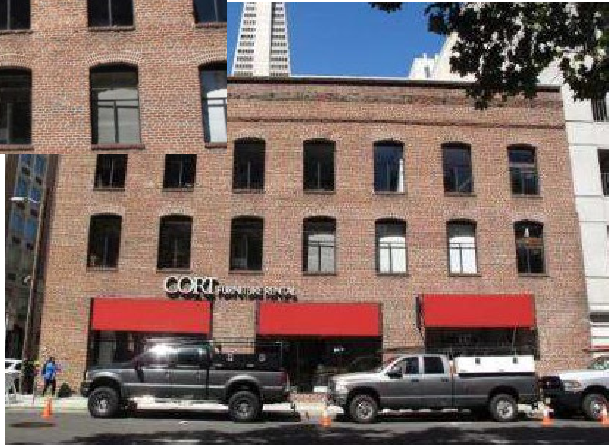
Right: Battery Street elevation, 2017