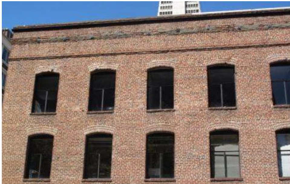
Above: Detail of upper story windows at Battery Street, 2017