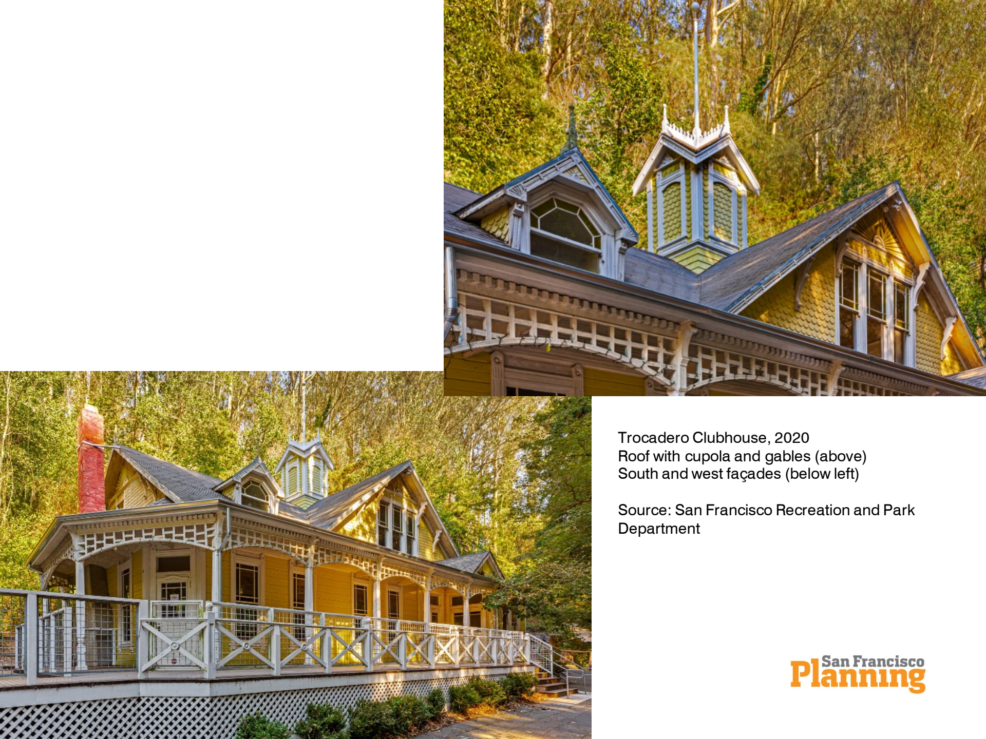
Trocadero Clubhouse, 2020 Roof with cupola and gables (above) South and west façades (below left)