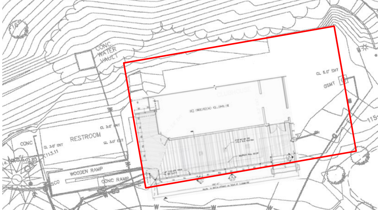
Landmark Boundary: Trocadero Clubhouse, boundary of the landmark designation shown in red.