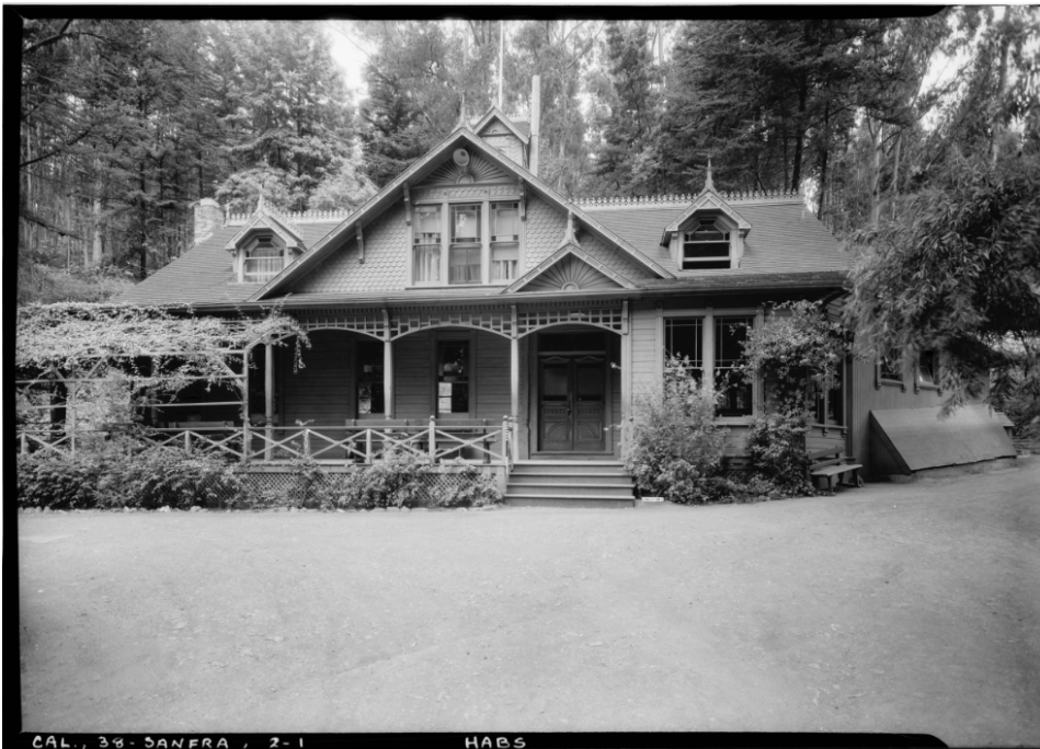
Trocadero Clubhouse, 1936 South façade (above left) Bar Room (below left)