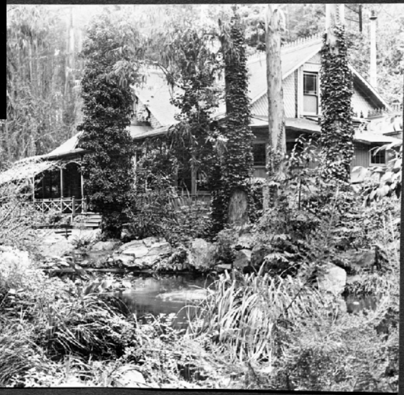
Trocadero Clubhouse, c. 1910 (top) and c. 1930 (right).