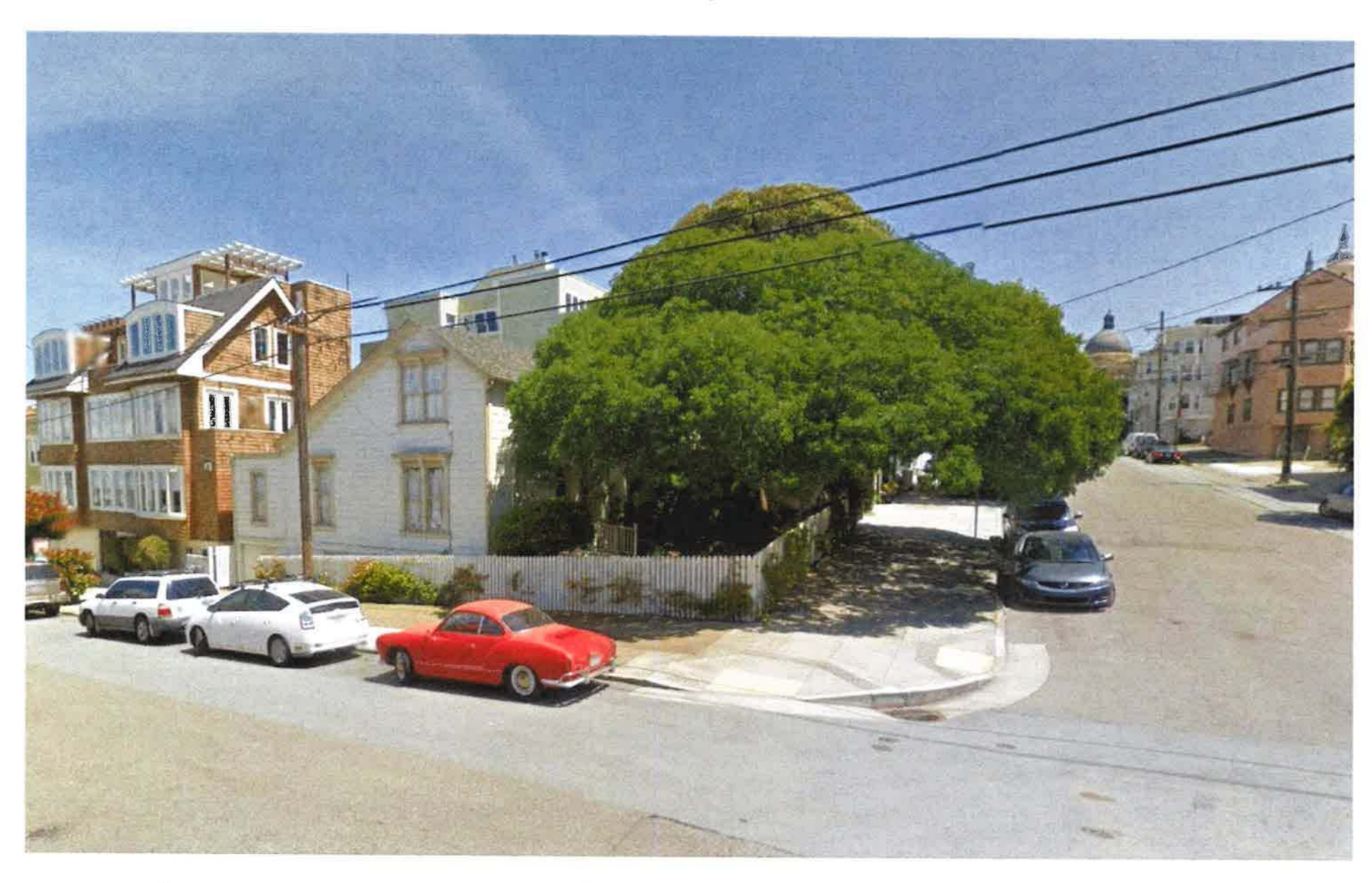
CAMFORNIA BUCKEME A7 2694 MCALUSTER & WILLARD