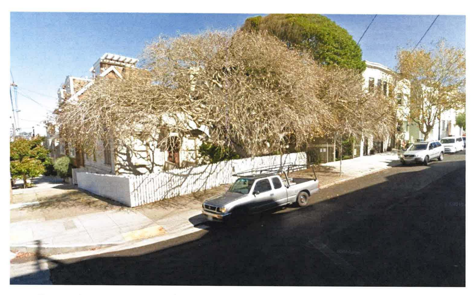
CALIFORMA BUCKEME AT 2694 MCALLISTER & WILLARD