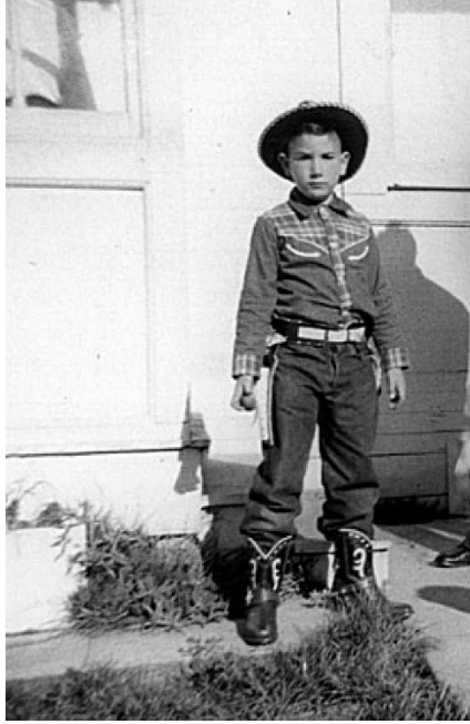
GARCIA/C/20AUG99/PK/HO-This is a photo of Jerry Garcia dressed as a cowboy in his youth.

Fans say they can hear the Excelsior's influence in Garcia's music. Although he was a hippie icon for three decades, he also favored bluegrass, blues and other working-class types of music -- a throwback to his youth in the blue-collar Outer Mission.