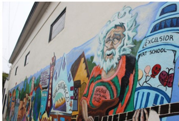
Detail of The San Francisco You Should Know on side of Central Drug Store building.

The form is simple (a rectangle), but the drugstore on the corner at 4494 Mission Street at the corner of Santa Rosa Avenue has a couple of big reasons for making this list. Central Drug Store is the oldest still-operating business in the Excelsior District, having opened in this spot in 1910. A circa 1950 alteration to the building gave us the sleek Vitrolite sign with "Central Drug Store" in neon. Jerry Garcia bought comic books here when he was a boy, and he is still playing the guitar on the south side of the building along Santa Rosa Avenue in the 2009 work by Precita Eyes Muralists, The San Francisco You Should Know .