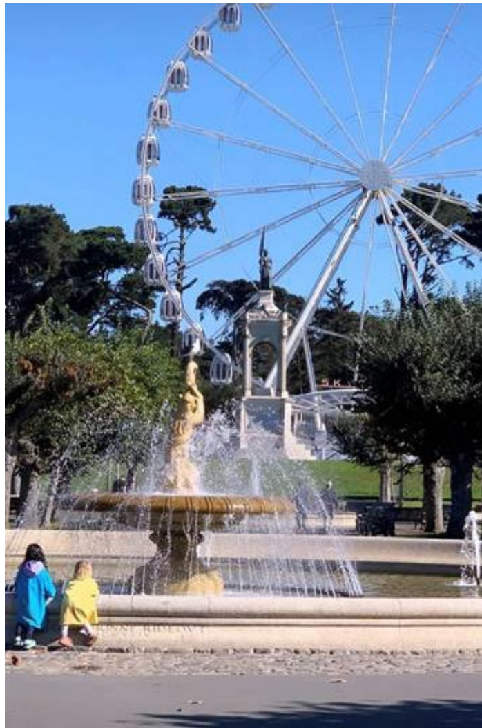
(Pictured: Stepping Stones Preschoolers watching the Wheel during free play time)