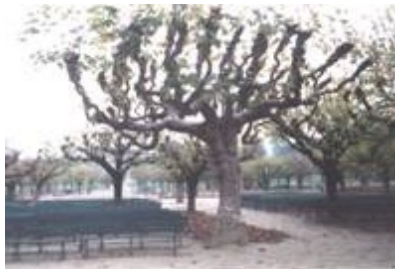
Friends of the Music Concourse (c) Dedicated to the Preservation