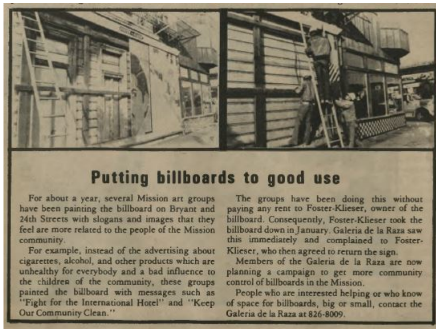
Newspaper clipping from El Tecolote Newspaper