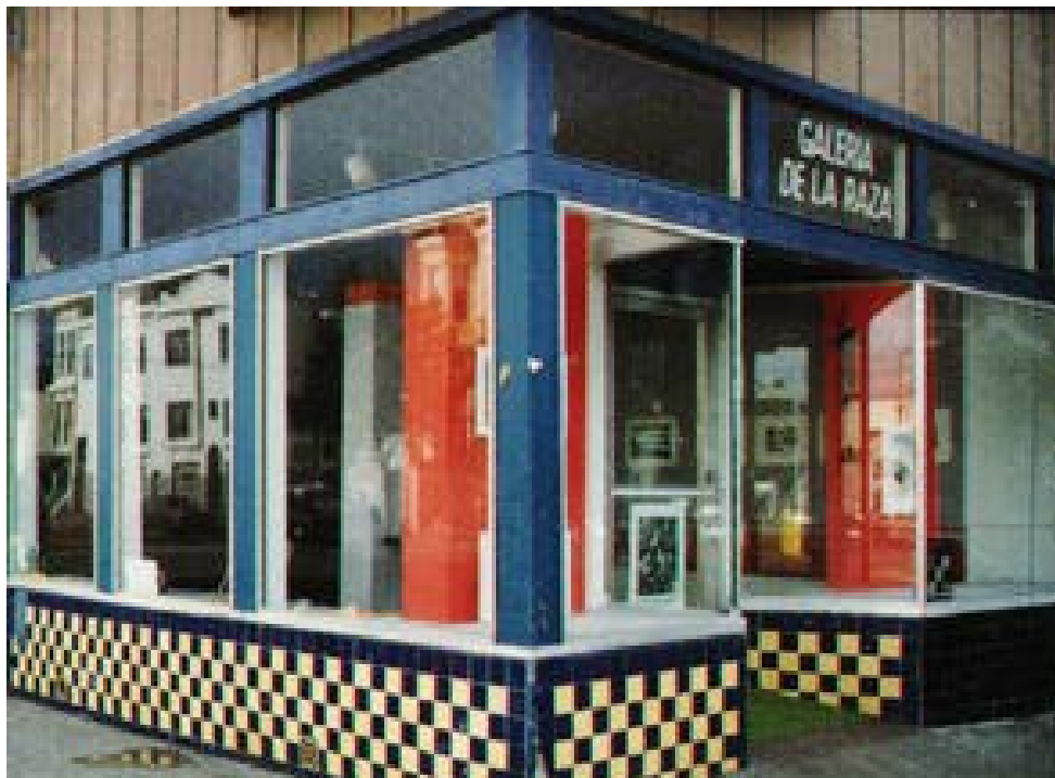
Galería de la Raza, circa 1972.