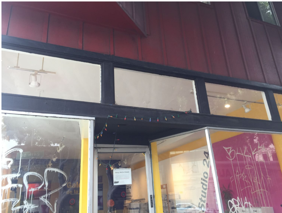
Transom above storefront entrance at 2851 24 th Street, view south, December 2018.