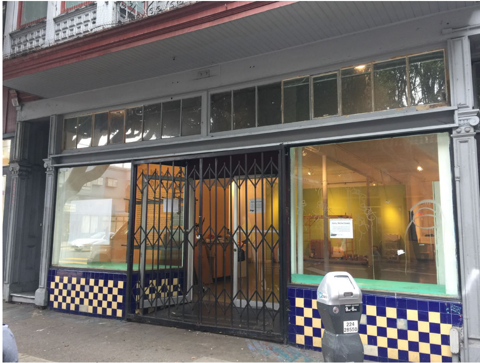
Storefront at 2857 24 th Street, view southwest, December 2018.