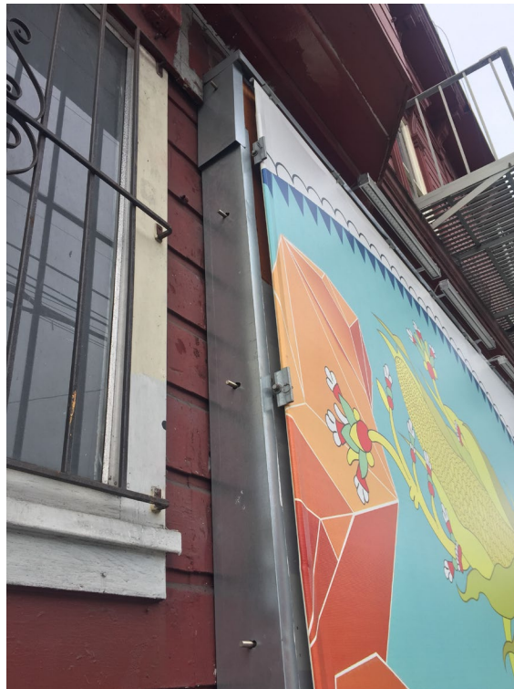
Detail of Bryant Street façade, view northwest, December 2018.