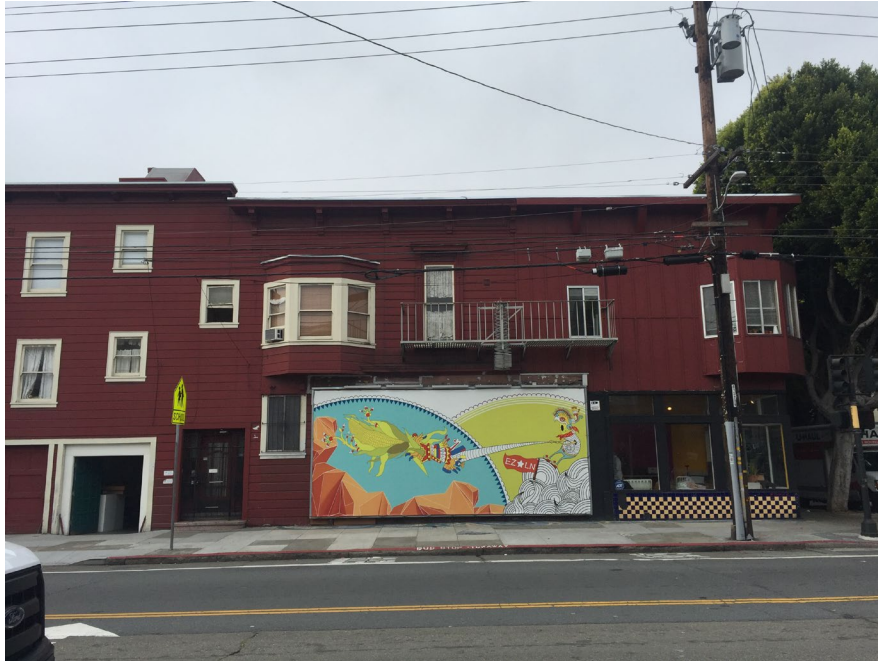
Bryant Street façade, location of Galería de la Raza/Studio 24's temporary mural, December 2018.