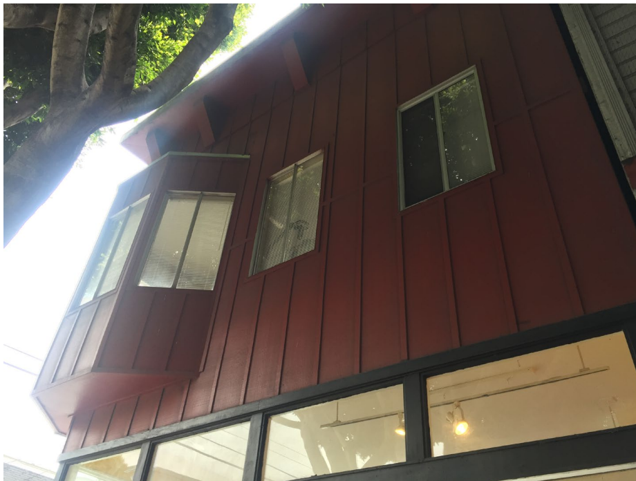
Upper portion of 2851 24 th Street, view southeast, December 2018.