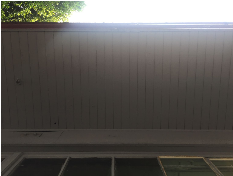
Soffit above storefront at 2857 24 th Street, December 2018.