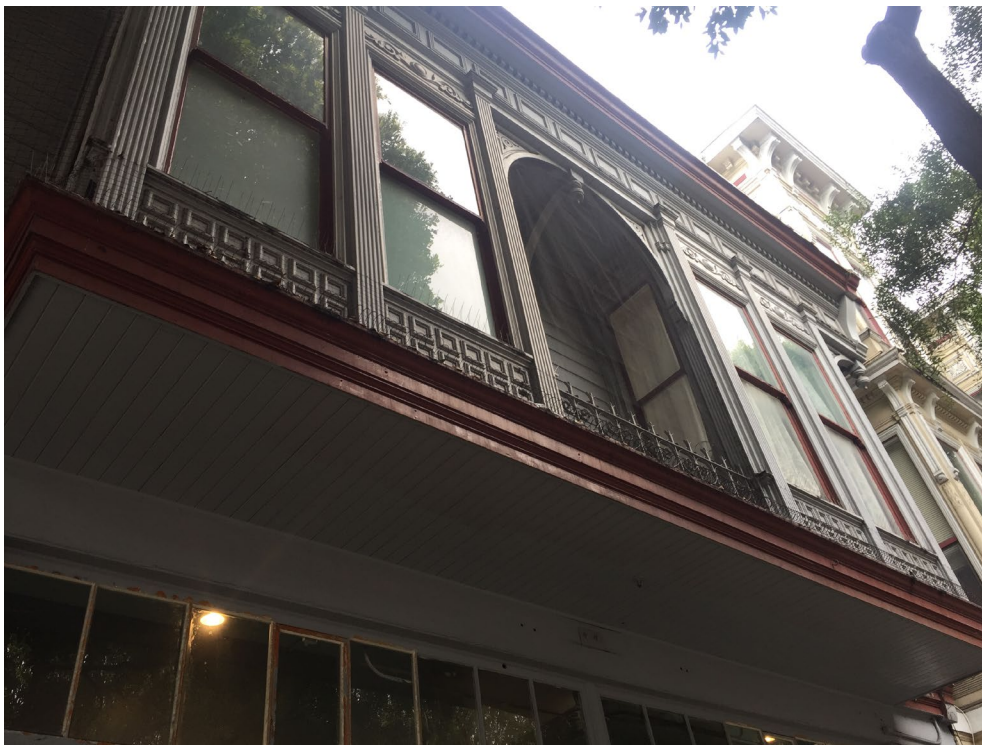
Upper portion of 2855-2861 24 th Street, showing bay windows, view southwest, December 2018.