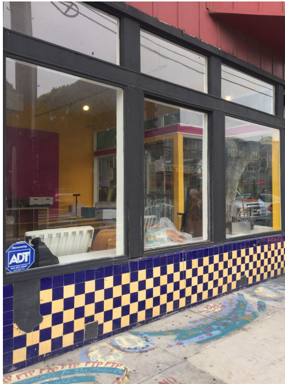
Detail of bulkhead and storefront windows at 2851 24 th Street, view southwest, December 2018.