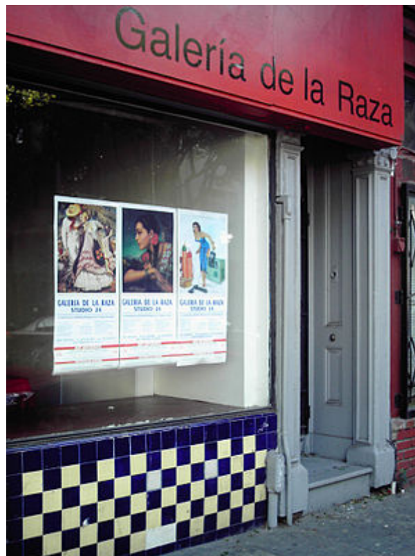
Signage above storefront at 2857 24 th Street, 2007.