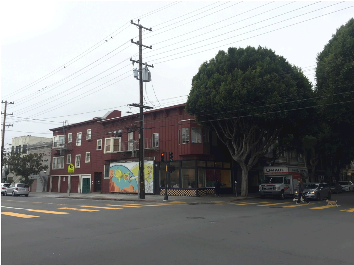
2851-2861 24 TH STREET

Article 10 Landmark Designation Case Number 2018-017223DES Galería de la Raza/Studio 24 Building 2851-2861 24 th Street