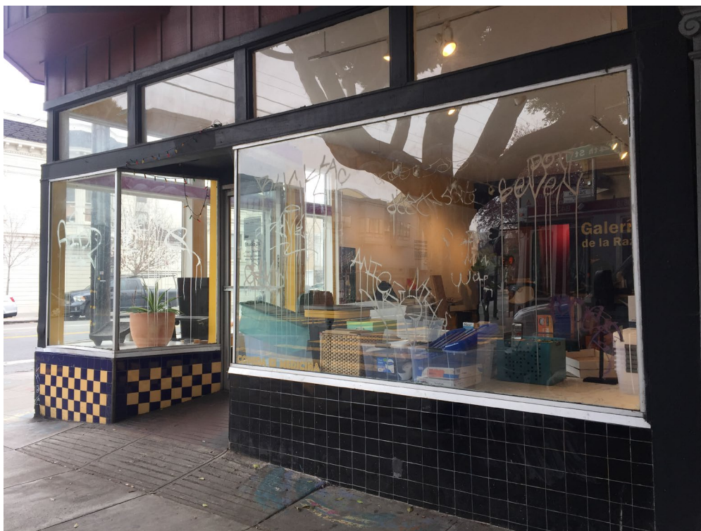
Corner storefront at 2851 24 th Street, view southeast, December 2018.