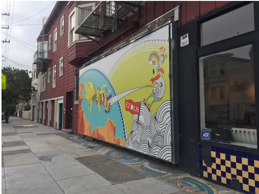
Bryant Street façade, view southwest, December 2018.