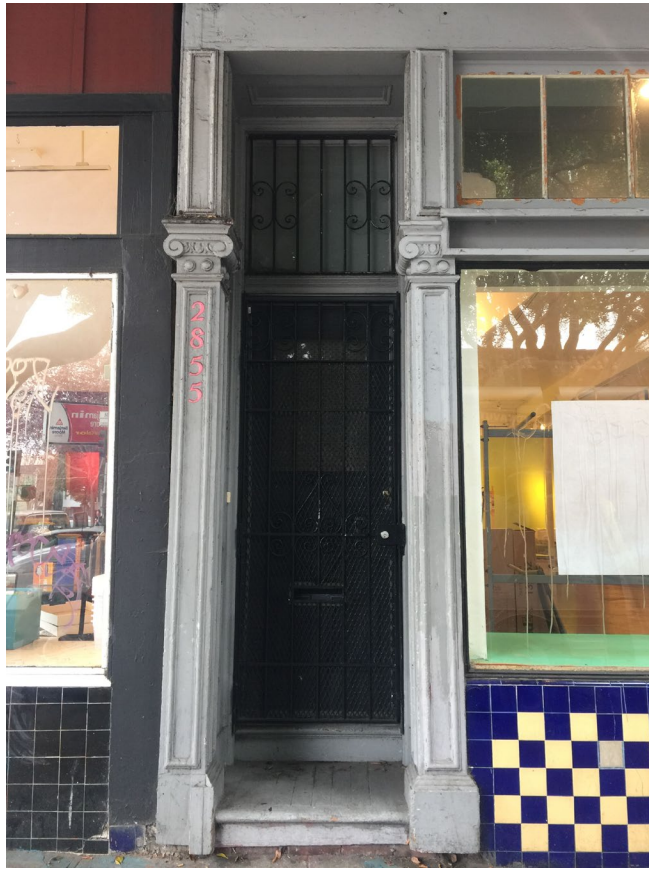
Entrance to 2855 24 th Street, view south, December 2018.