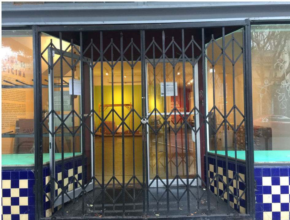
Close up of storefront at 2857 24 th Street, view south, December 2018.