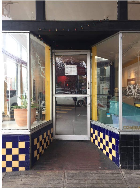
Recessed vestibule and entry door of storefront at 2851 24 th Street, view south, December 2018.