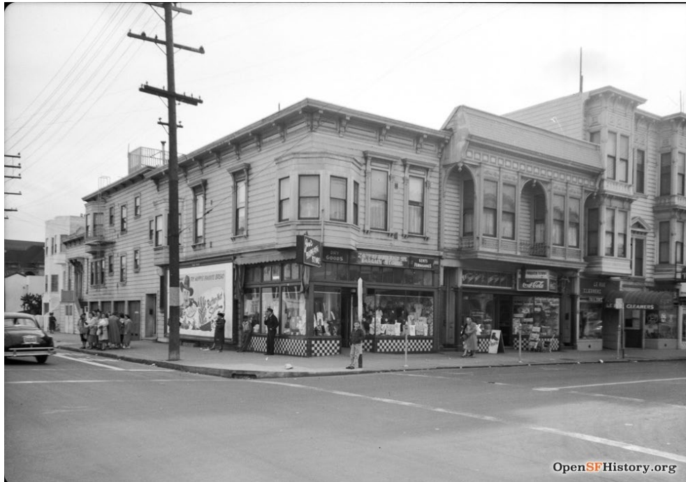
Subject property in Assessor's Photo from 1951