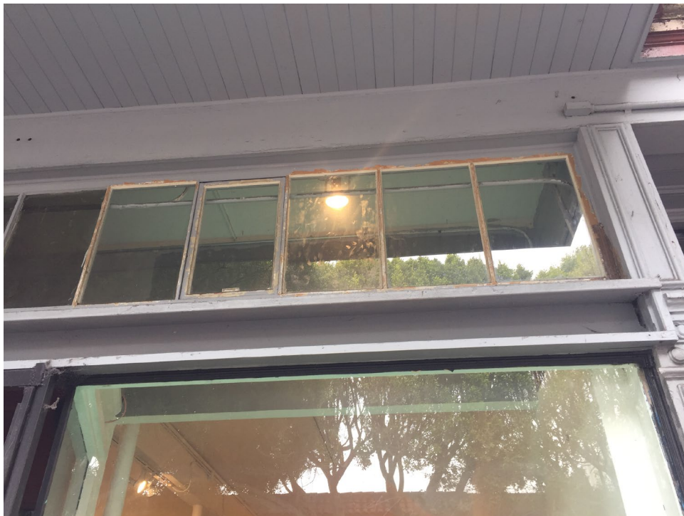
Transom and soffit of the storefront at 2857 24 th Street, December 2018.