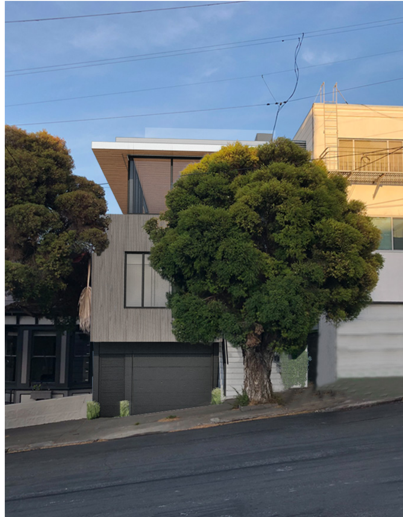
Potrero Hill Residence 249 Texas St. San Francisco, CA