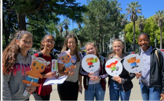
Kids Day at the Capital