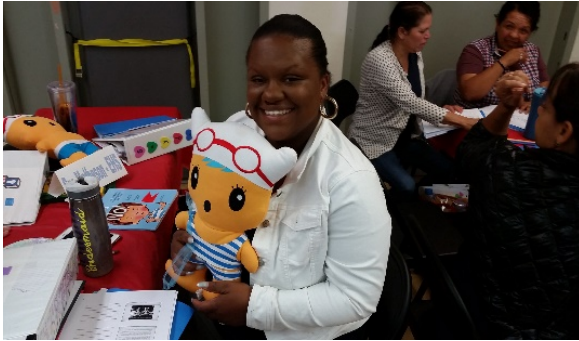
Head Start Educator Training