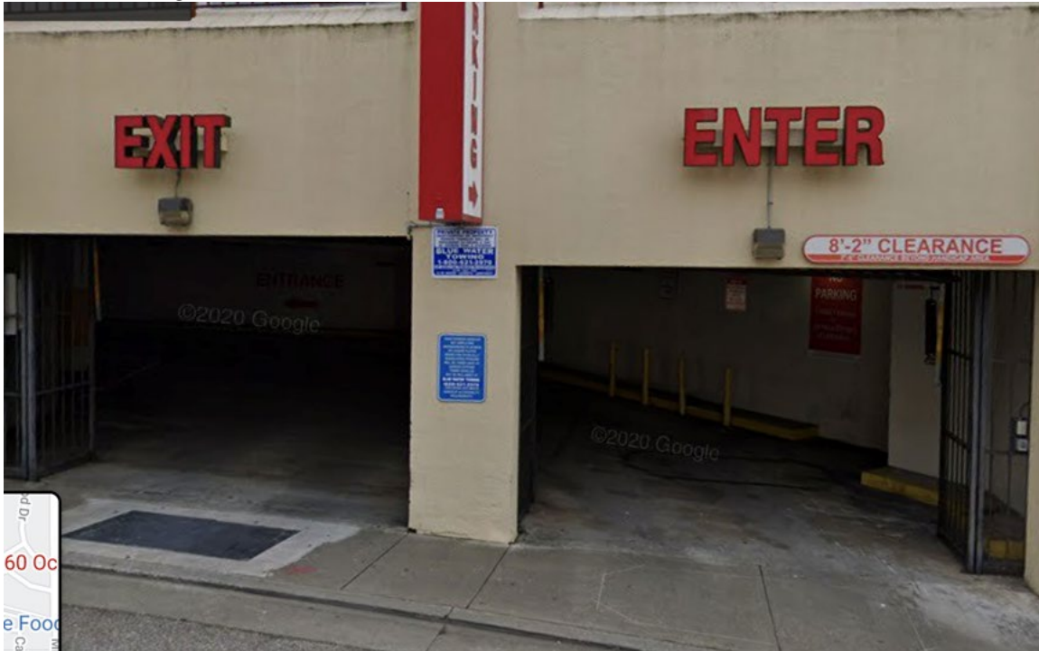
Photo of Garage Clearance at 1738 / 1760 Ocean Ave which shows clearance as 8'2":