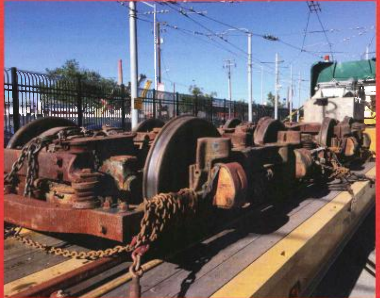
The vintage Peckham 14 B3 streetcar trucks arrive at Muni Metro East from Connecticut.

Also at Marin Street is the derelict body of cable car trailer 68, which last operated on the Pacific Avenue cable line, closed in 1929. It lacks a truck or platforms and is in very poor condition. We will tell its story in the next issue of Inside Track .