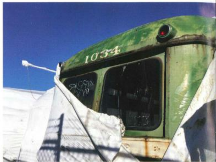
SAVED —Car 1034 is one of six 'Baby-Ten' class PCCs, all reacquired by Muni through Market Street Railway, that is being preserved and moved to secure storage at the Cow Palace.

The twelve PCCs to be disposed of are: 1023, 1031, 1038, 1054 (totaled in a 2001 accident; the front end will be saved for possible future accident repair of a 1050-class car), 1106, 1108, 1125, 1139, 1140, 2133 (ex-SEPTA, partially restored by MSR volunteers as "1064" but found to have bad rust); and ex-Pittsburgh cars 4008 and 4009. The Pittsburgh car are a wider gauge than Muni, have sealed windows and are difficult