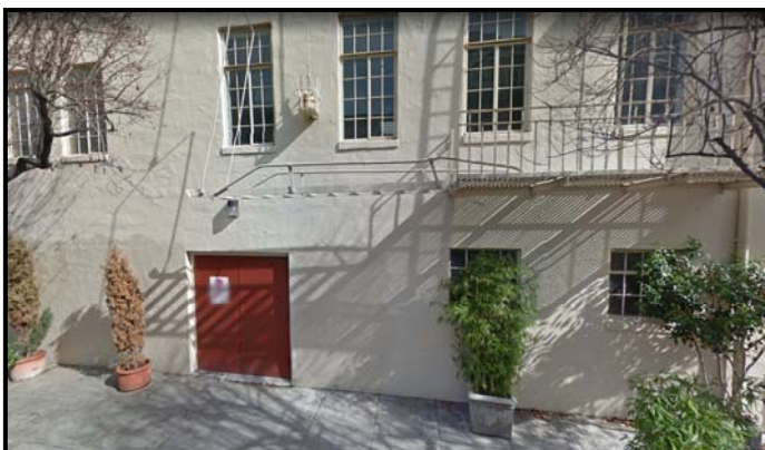
Service entrance from Elgin Avenue to 170 Valencia Street

The composition of land uses in the area immediately surrounding the subject site is varied. Generally, the current zoning which splits the subject site's city block is appropriate for the neighborhood, as there is a stark contrast between the land uses on the east side of the block (Valencia Street), and the west side of the block (Elgin Avenue). In addition to the former Baha'i Temple building, the land uses along this block of Valencia Street consist of commercial uses such as an oil change station, several restaurants, and a furniture store. The land uses along Elgin Avenue at the back of the subject site are largely multi-unit residential and mixed-use residential. Though generally appropriate for this block, the current zoning fails to take into account the building at 170 Valencia. The subject building is one unit, and though there is a service entrance that faces onto Elgin Avenue, the main entrance is located on Valencia Street. The building has been used as a Community Facility use since its construction, and intends to remain as a Community Facility when the SFGMC moves in.