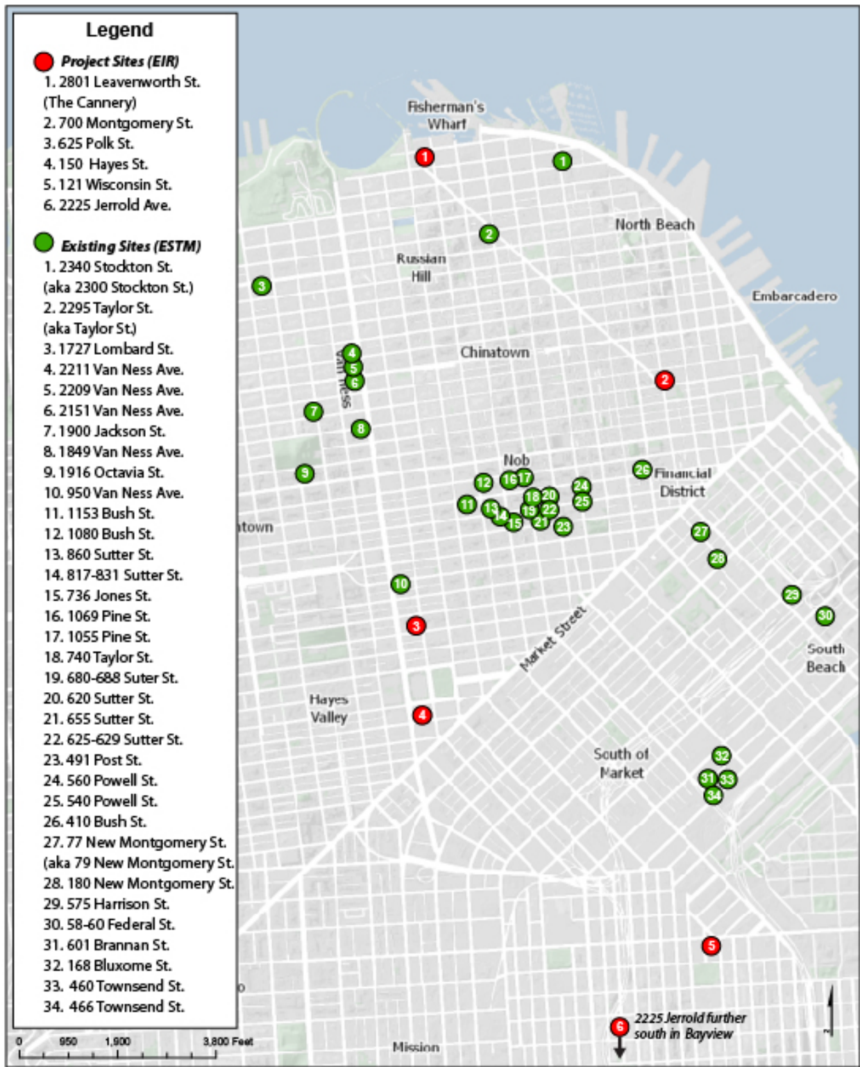
AAU Project & Existing Sites - Figure 1

The City and County of San Francisco (CCSF) does not guarantee the accuracy, adequacy, completeness or usefulness of any information. CCSF provides this information on an "as is" basis without warranty of any kind, including but not limited to warranties of merchantability or fitness for a particular purpose, and assumes no responsibility for anyone's use of the information.