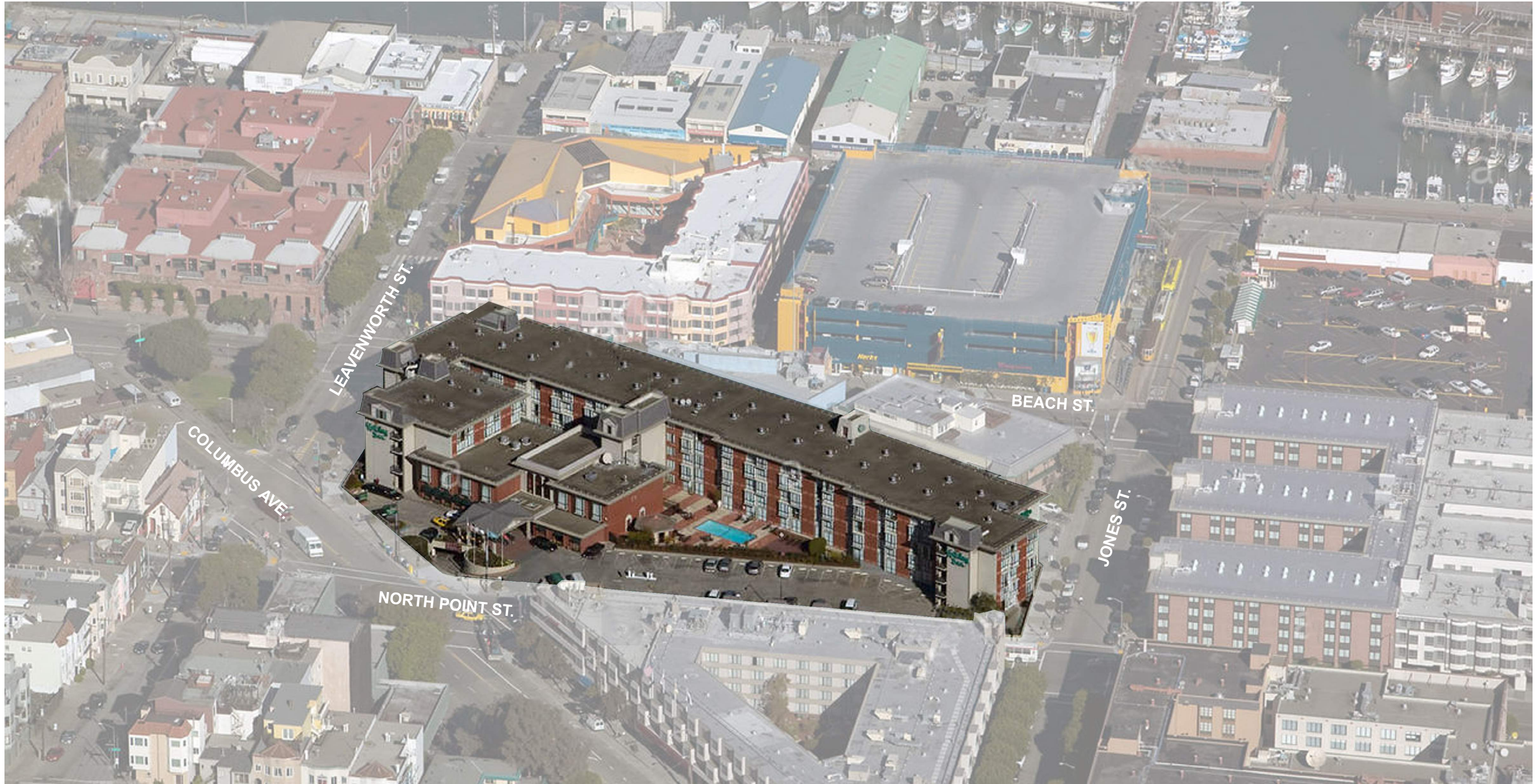
1300 COLUMBUS AVENUE PLANNING COMMISSION HEARING . FEBRUARY 20, 2020