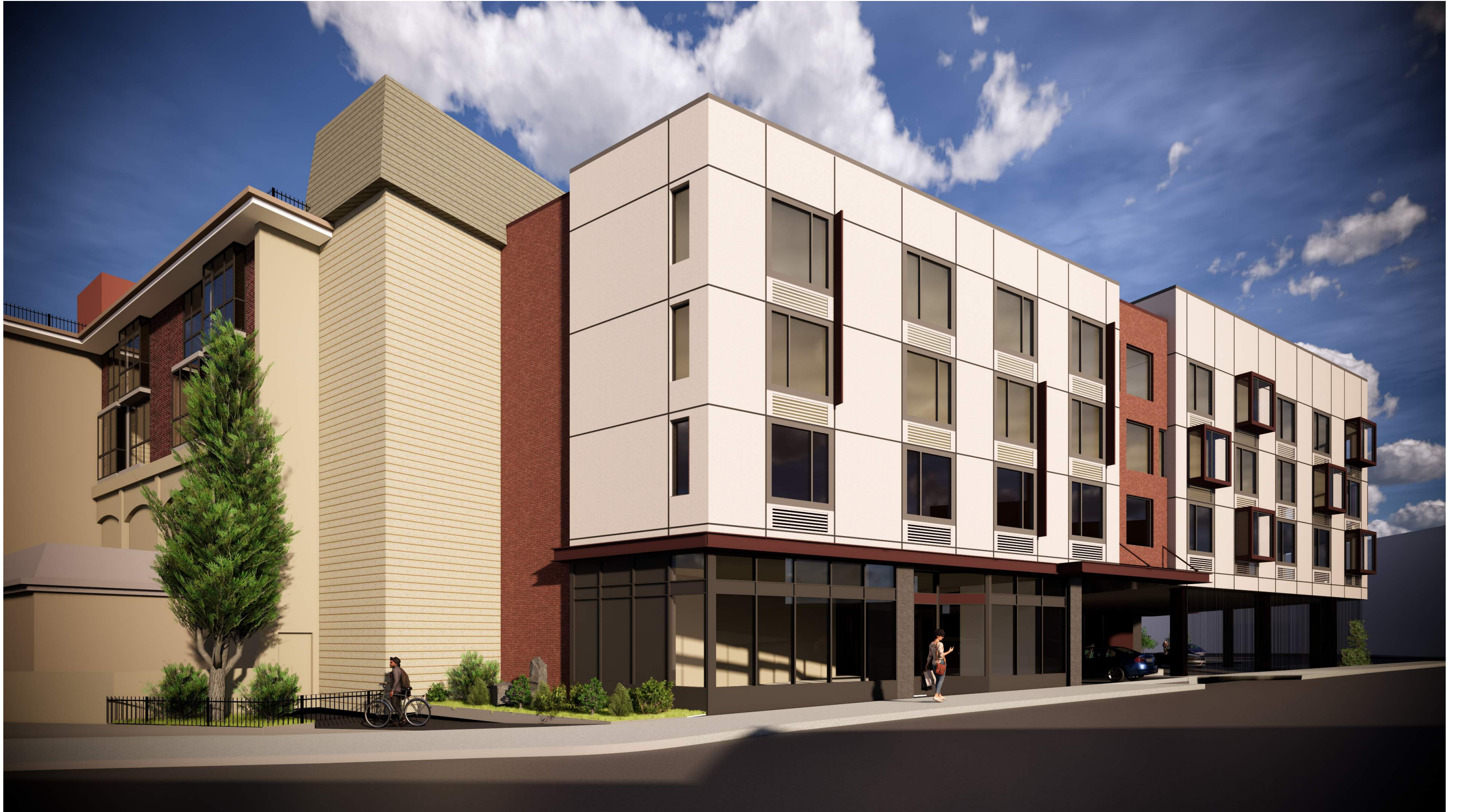
1300 COLUMBUS AVENUE PLANNING COMMISSION HEARING . FEBRUARY 20, 2020