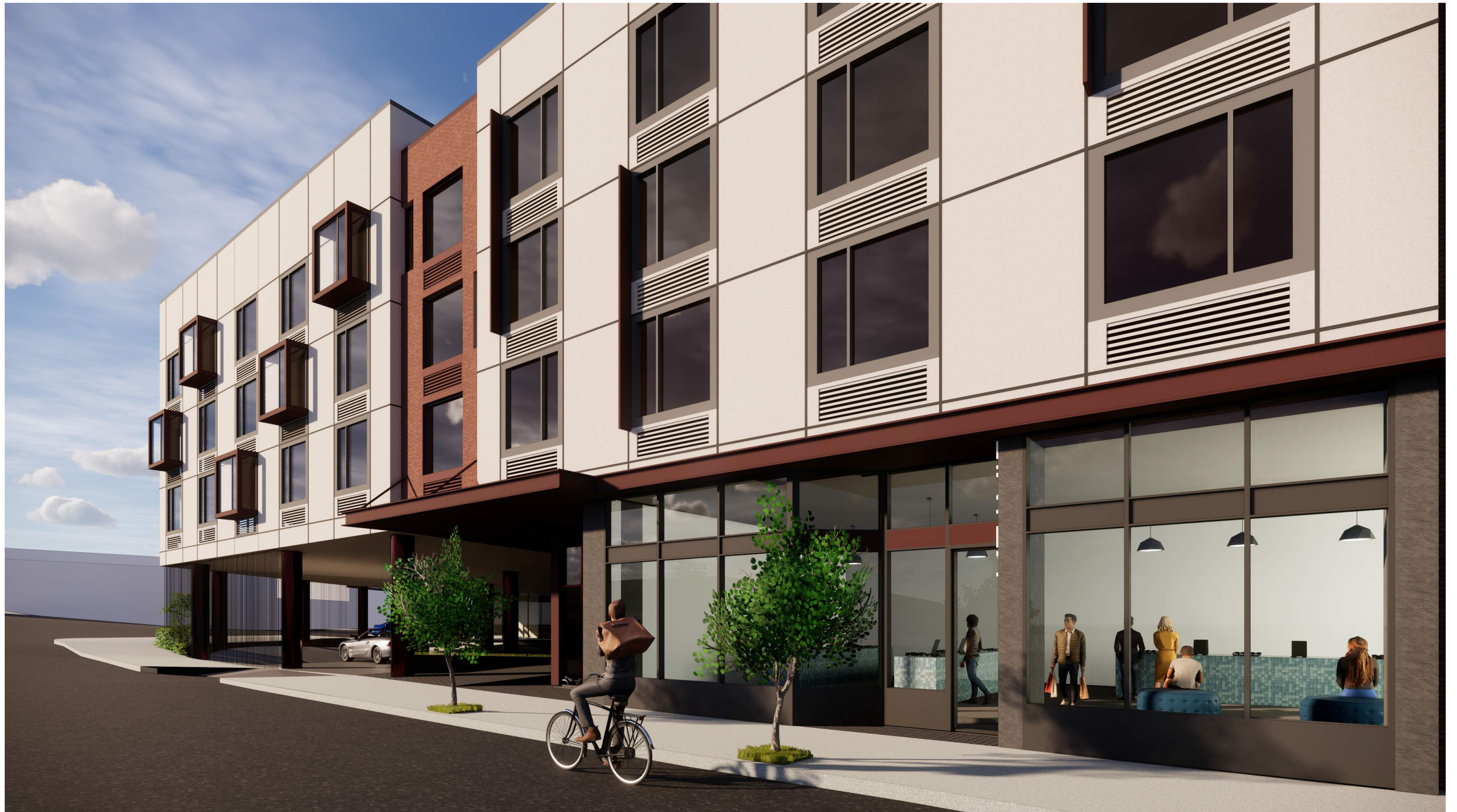
1300 COLUMBUS AVENUE PLANNING COMMISSION HEARING . FEBRUARY 20, 2020