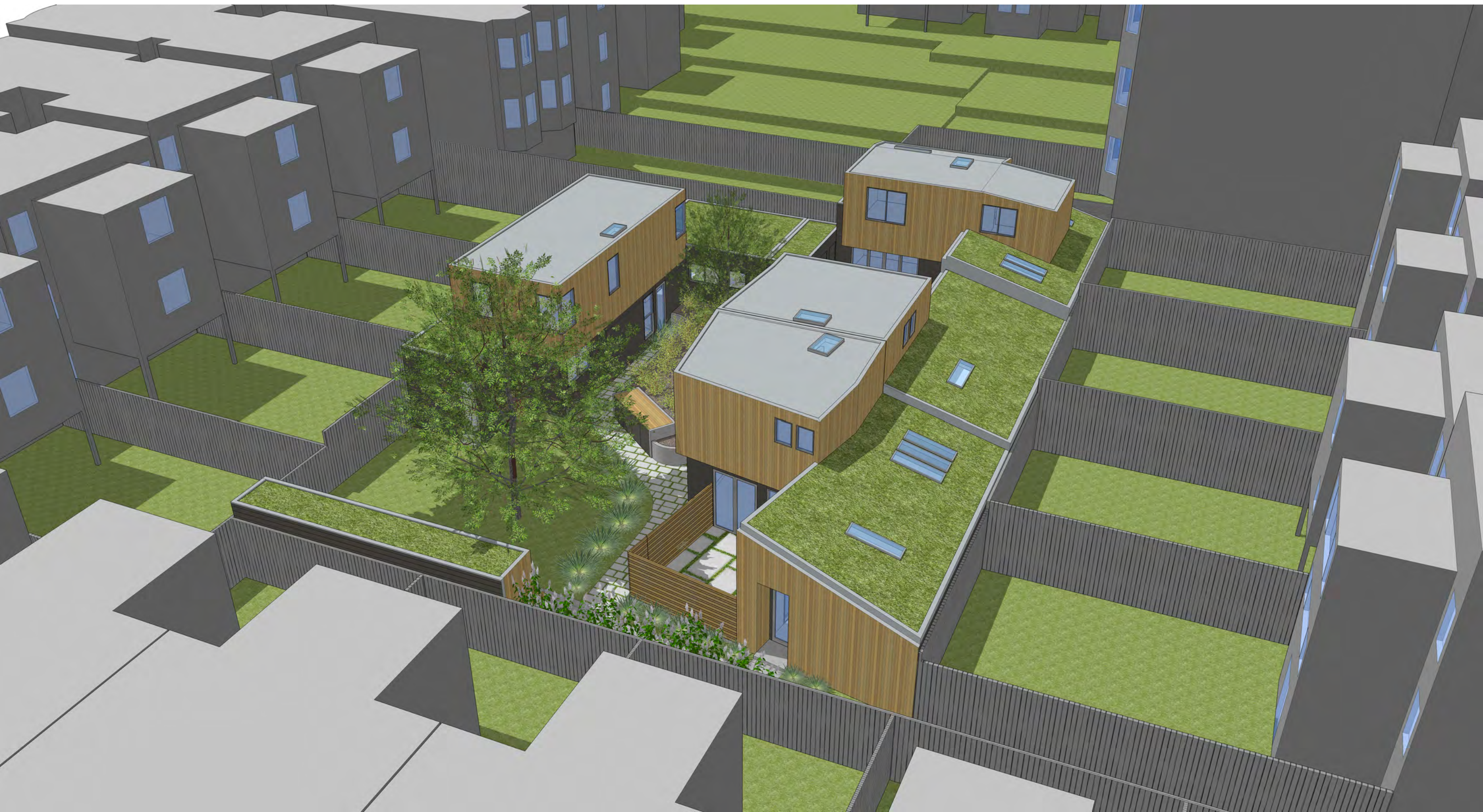
Overhead view from Northeast