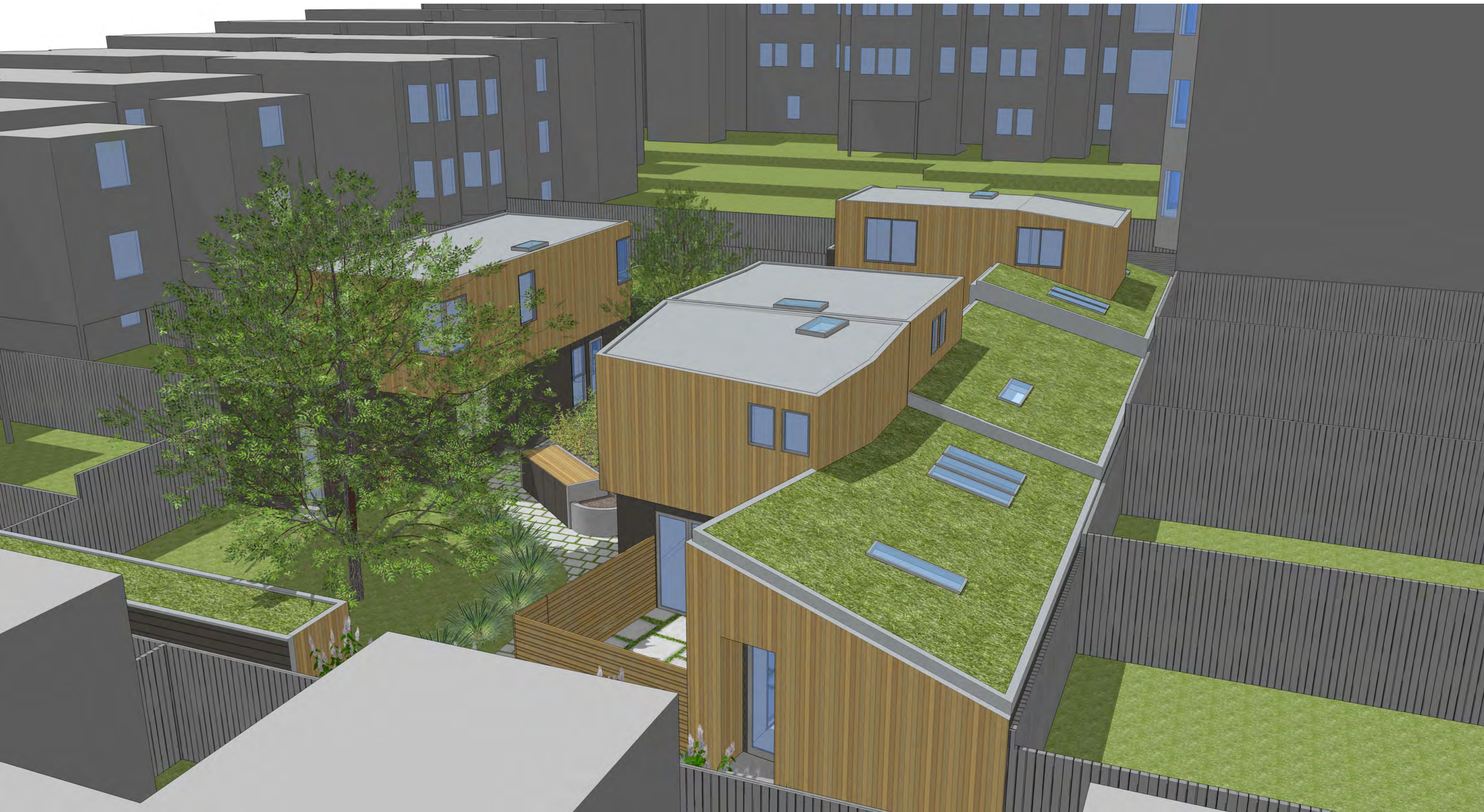
View from Northeast