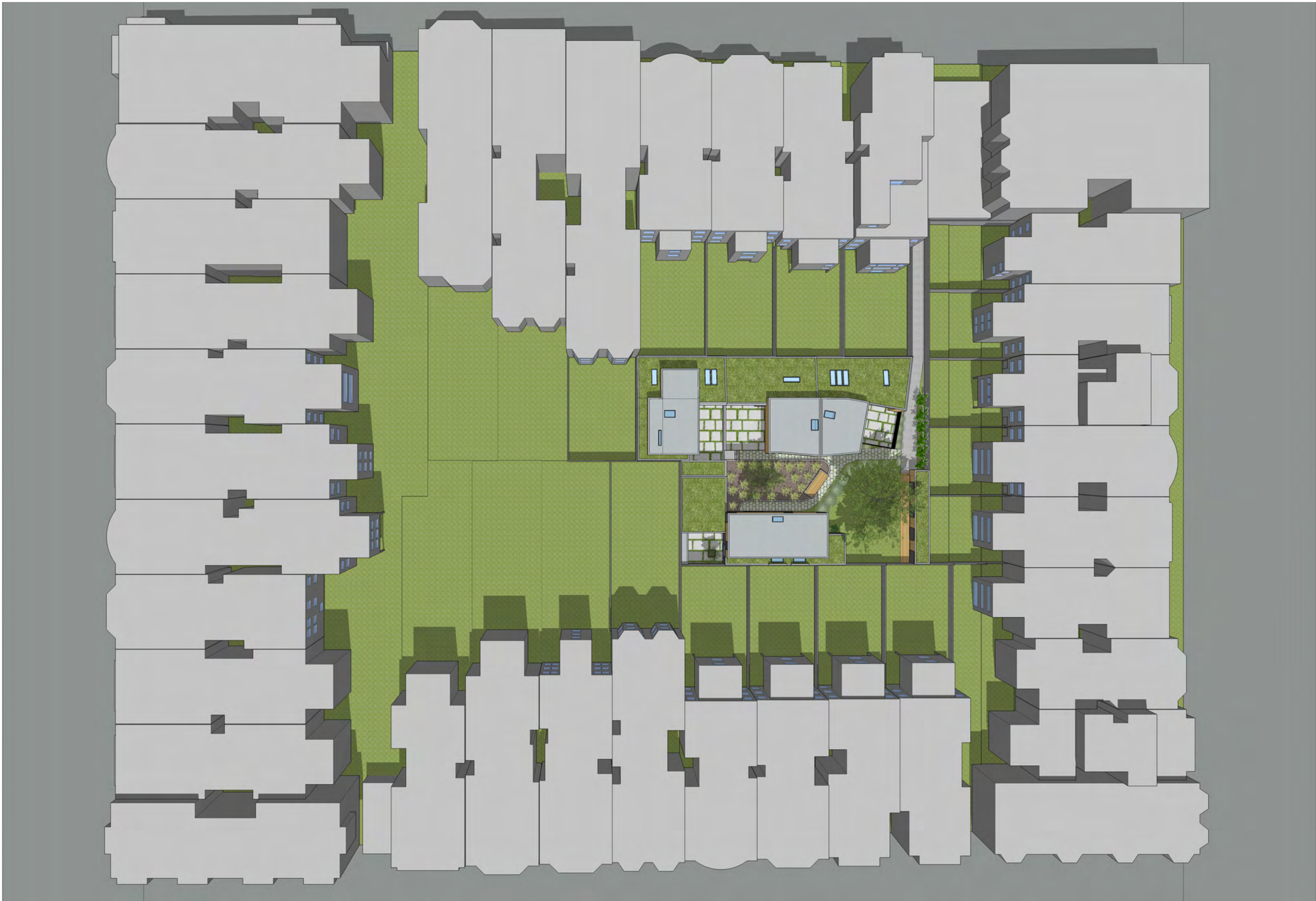
Site and Buildings In the context of the block