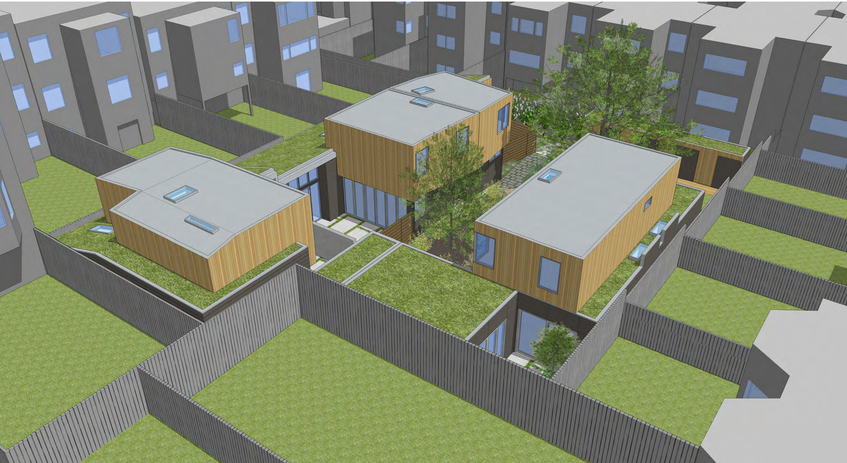
View from Southwest