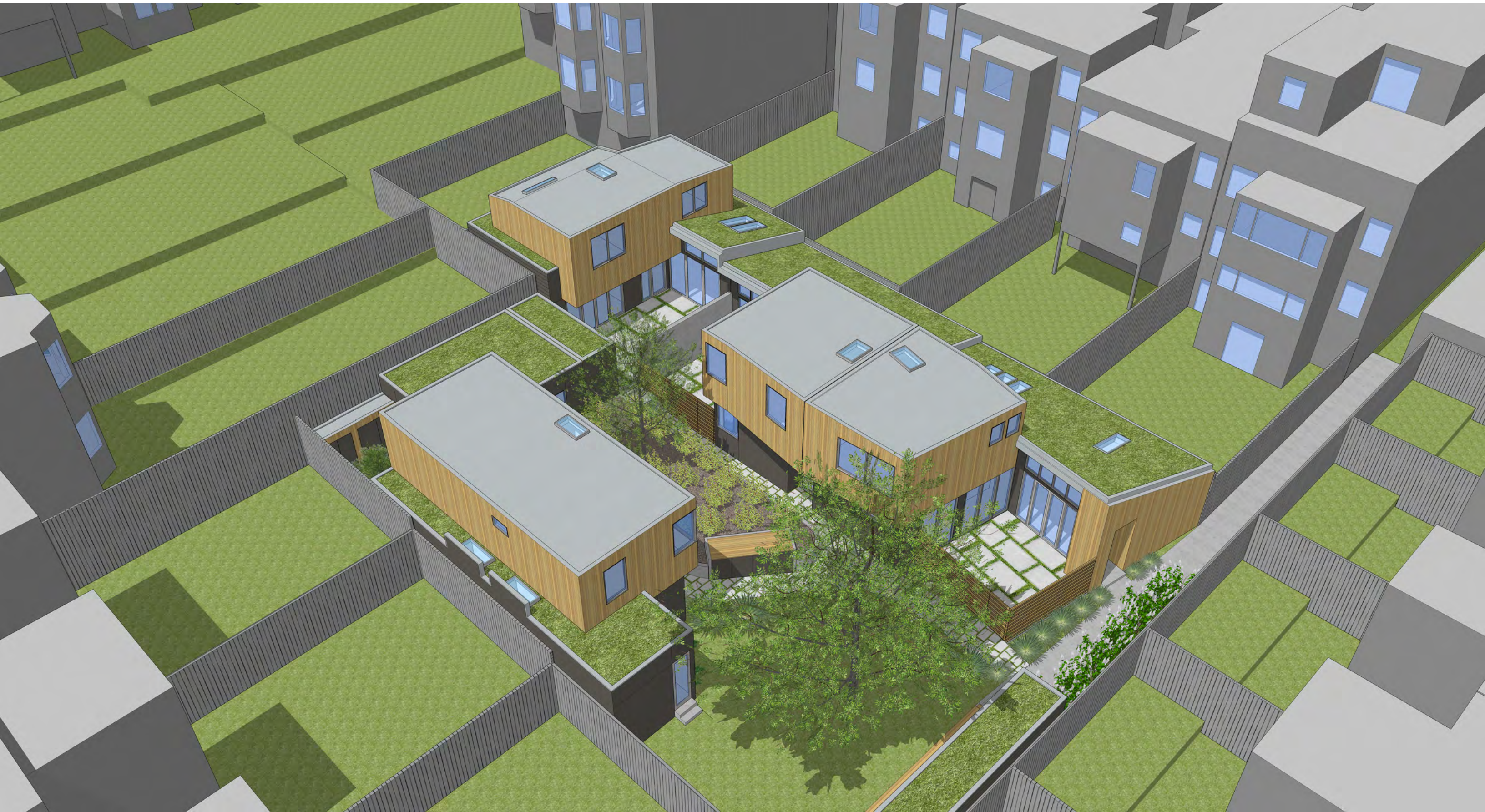
Overhead view from Southeast