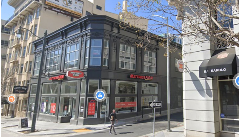
Left: Corner of Van Ness & Austin Streets