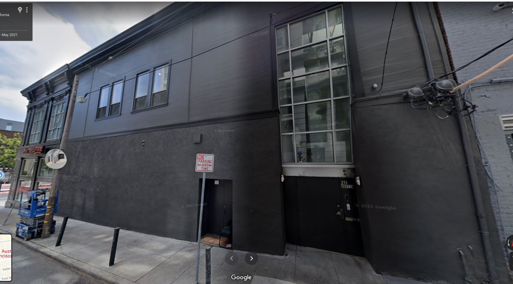
Below: Subject site entry

Conditional Use Authorization Case Number 2021-006288CUA Arthur Murray Dance Studio 211 Austin Street