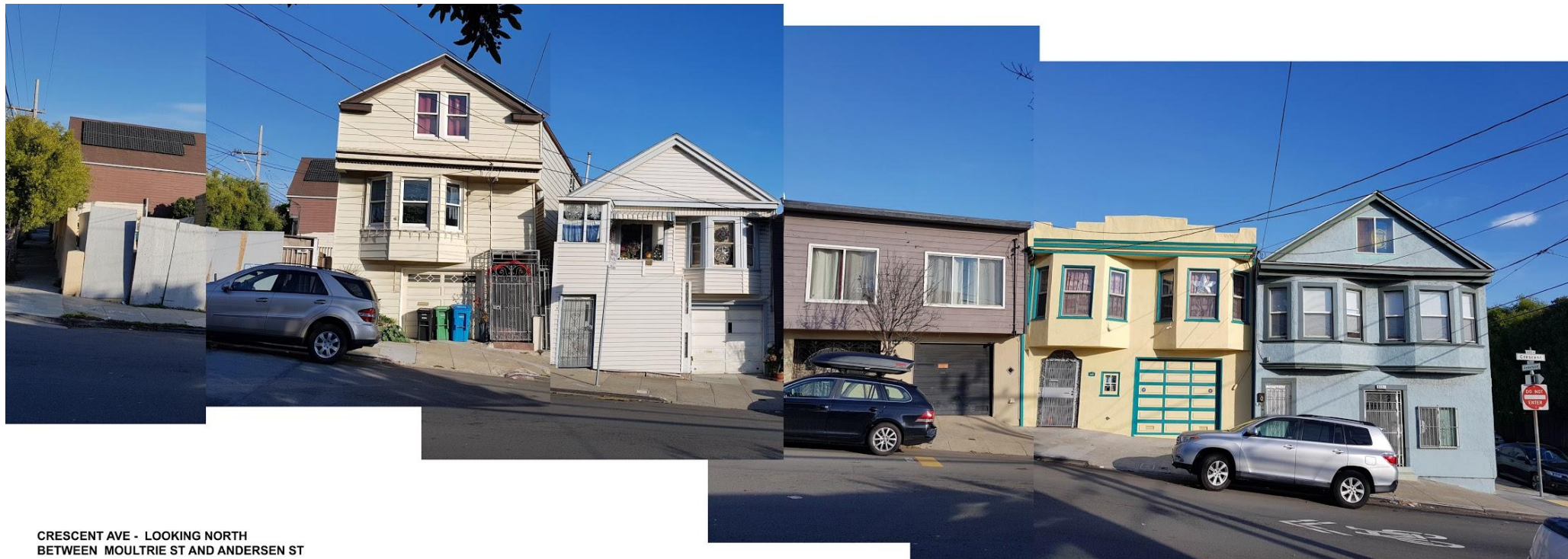
CRESCENT AVE - LOOKING NORTH BETWEEN MOULTRIE ST AND ANDERSEN ST