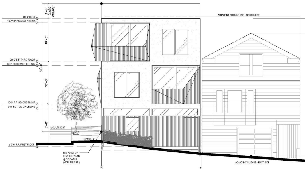
2 (N) SOUTH ELEVATION SCALE: 1/4" = 1'-0"