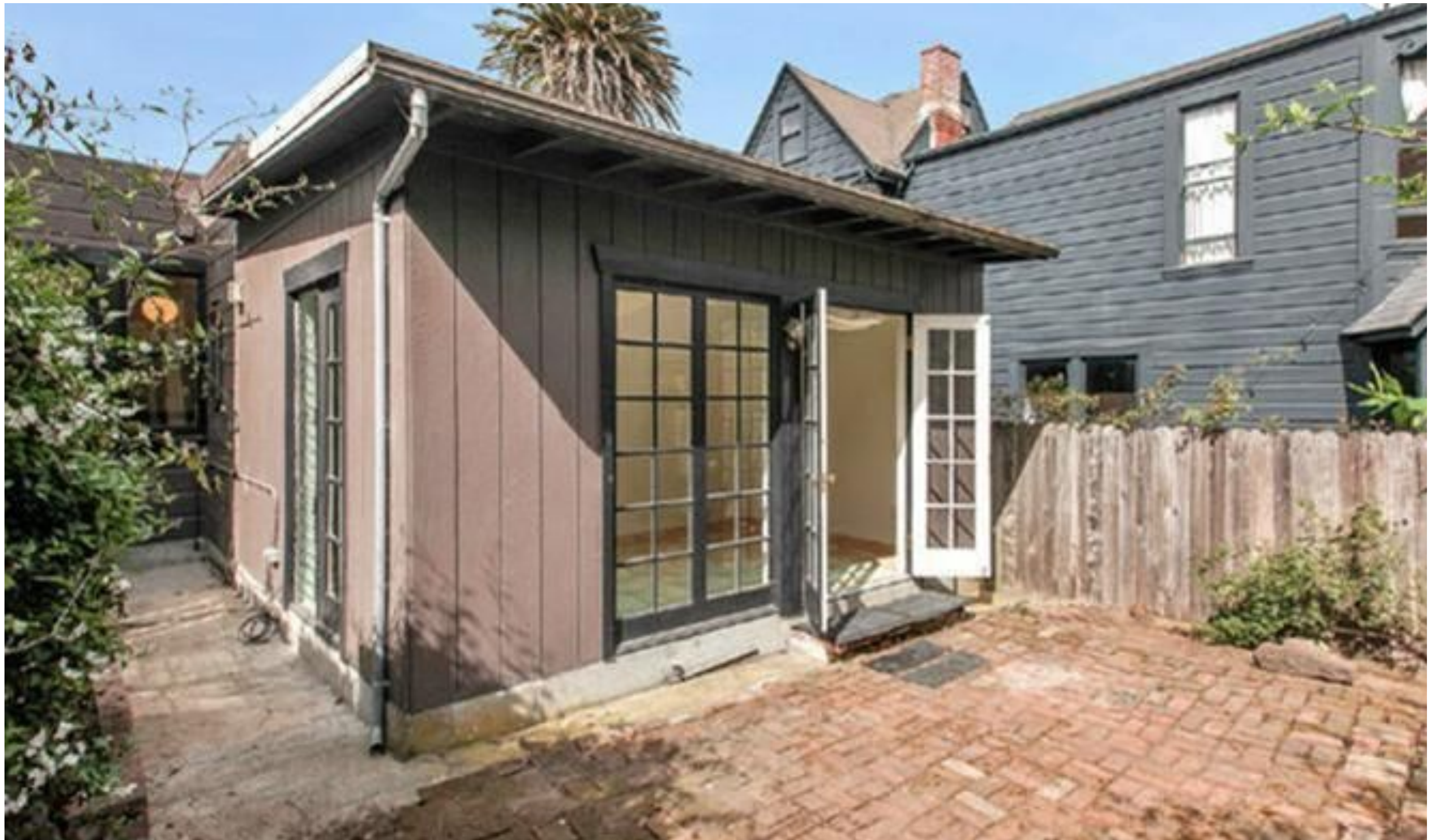
ARMOUR-CHOREBANIAN RESIDENCE | 136 DELMAR STREET