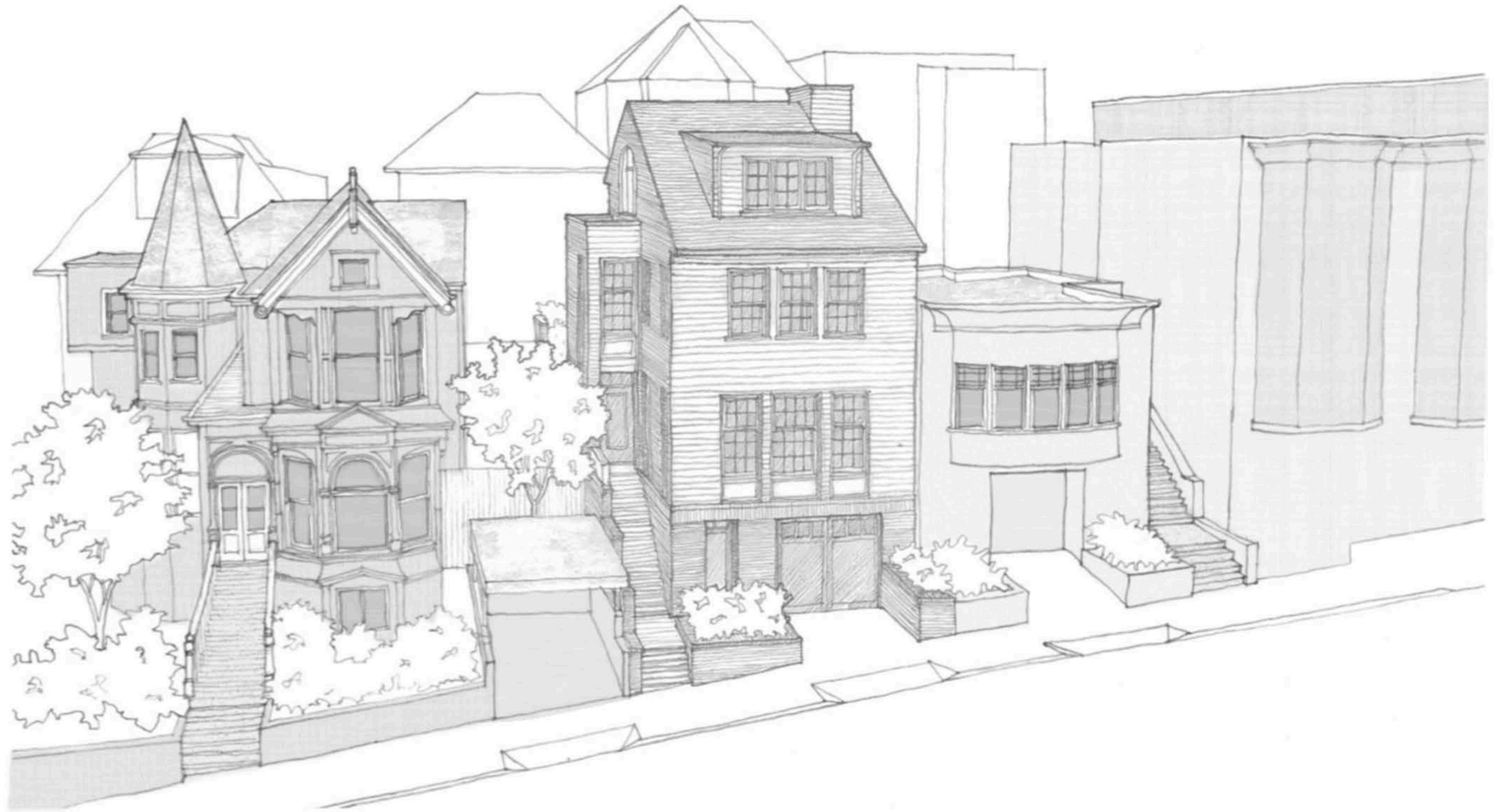
ARMOUR-CHOREBANIAN RESIDENCE | 136 DELMAR STREET, SAN FRANCISCO