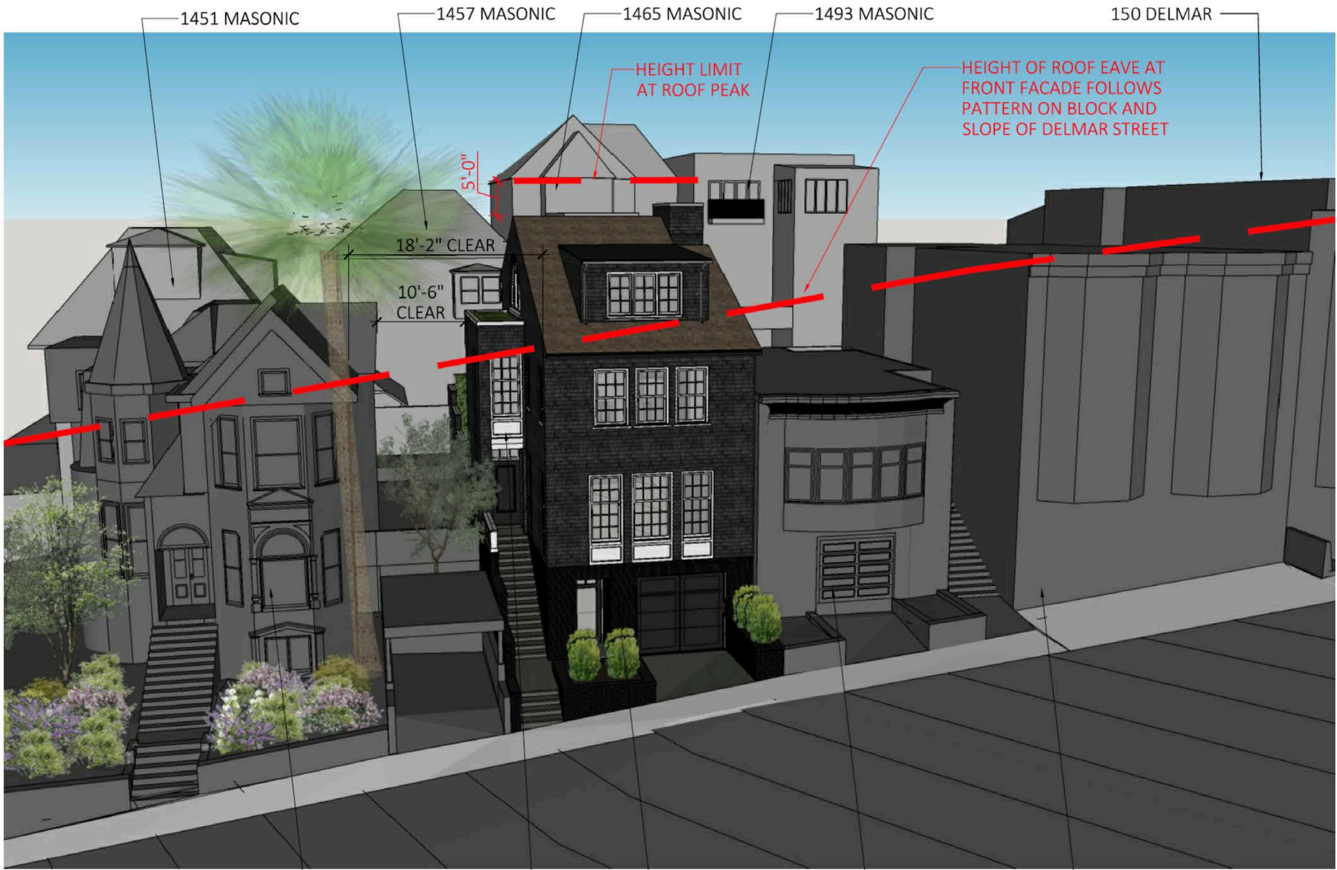
ARMOUR-CHOREBANIAN RESIDENCE 136 DELMAR STREET

PRIMARY MASSING SET 5' FROM NORTH PROPERTY LINE, PROVIDING A SIDE OFFSET IN RECOGNITION OF ADJACENT CATEGORY 'A' HISTORIC RESOURCE AT 130