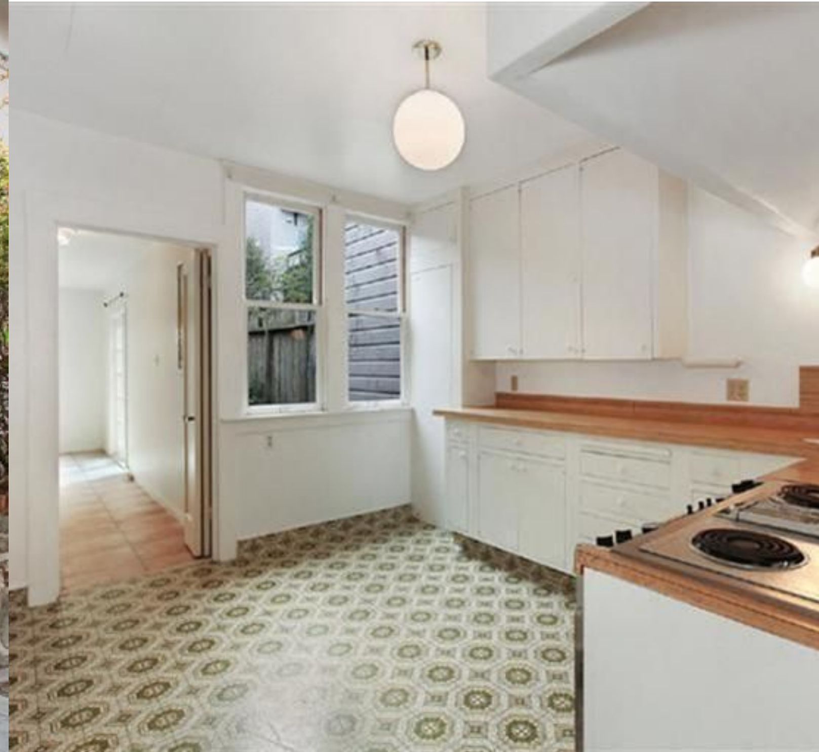
ARMOUR-CHOREBANIAN RESIDENCE 136 DELMAR STREET