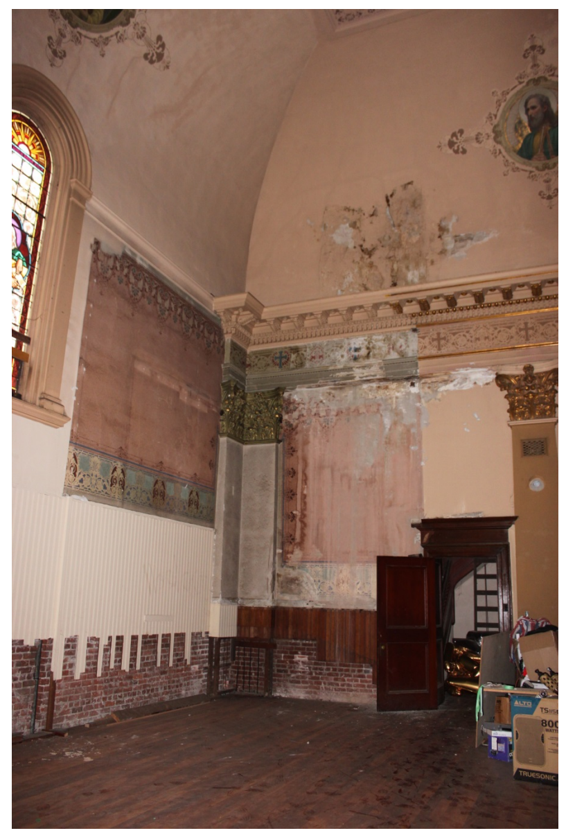
Photo 4. Choir loft, view northwest, 2016. Note decorative wall painting dating from an earlier period that was exposed when the organ was removed. Opening at right provides access to campanile stair. Trim above opening is likely similar to the trim that was removed at the connector opening to install the organ in 1923.