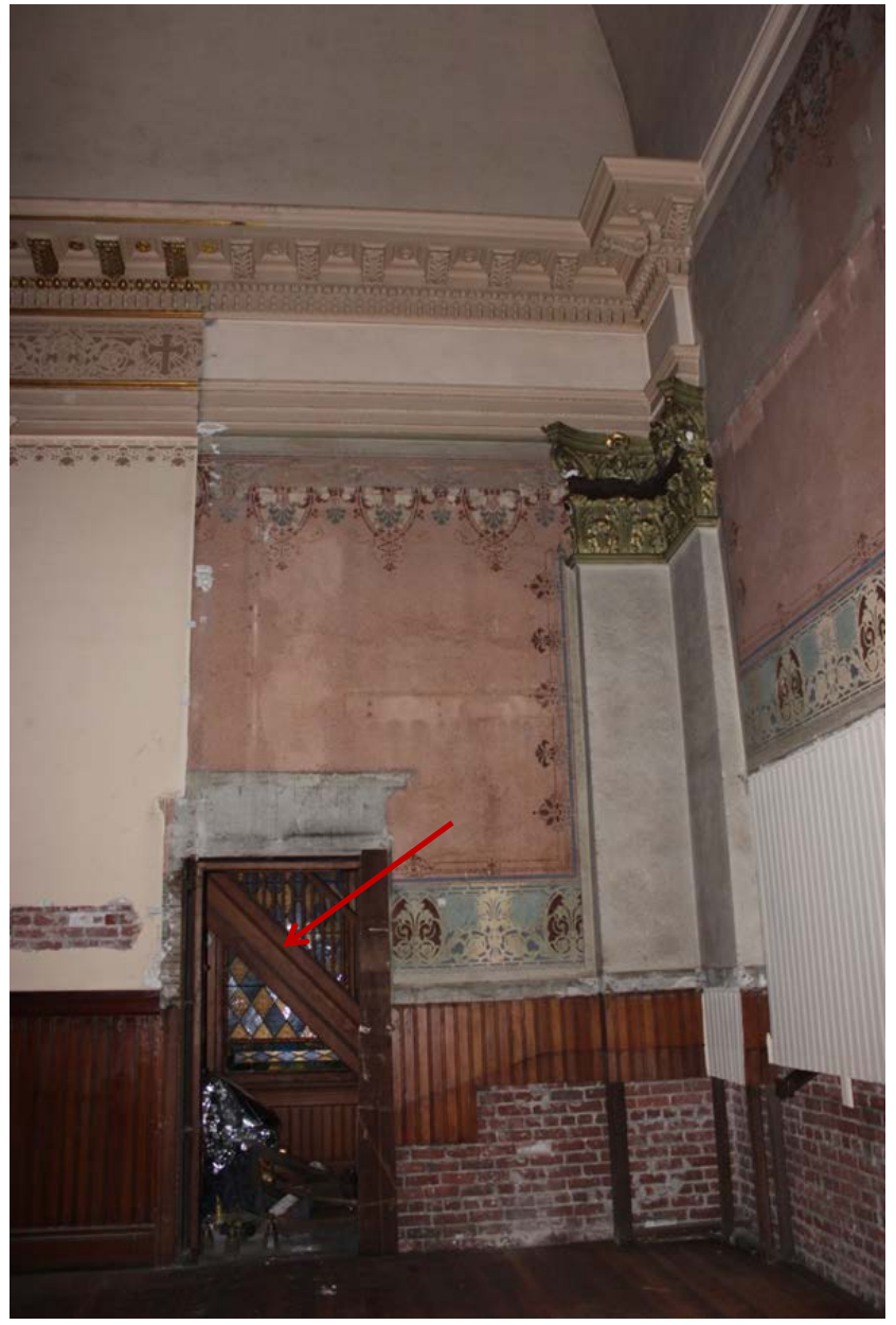
Photo 3. Choir loft, view south, 2016. Note the opening and stair (indicated by red arrow) that leads to the connector. The pipe organ was installed it 1923 and it blocked access to the connector. When the organ was removed sometime after 2009, the opening to the connector, as well as decorative wall painting dating from an earlier period was exposed. Also note ghosting above the opening from trim that was likely removed to install the organ.