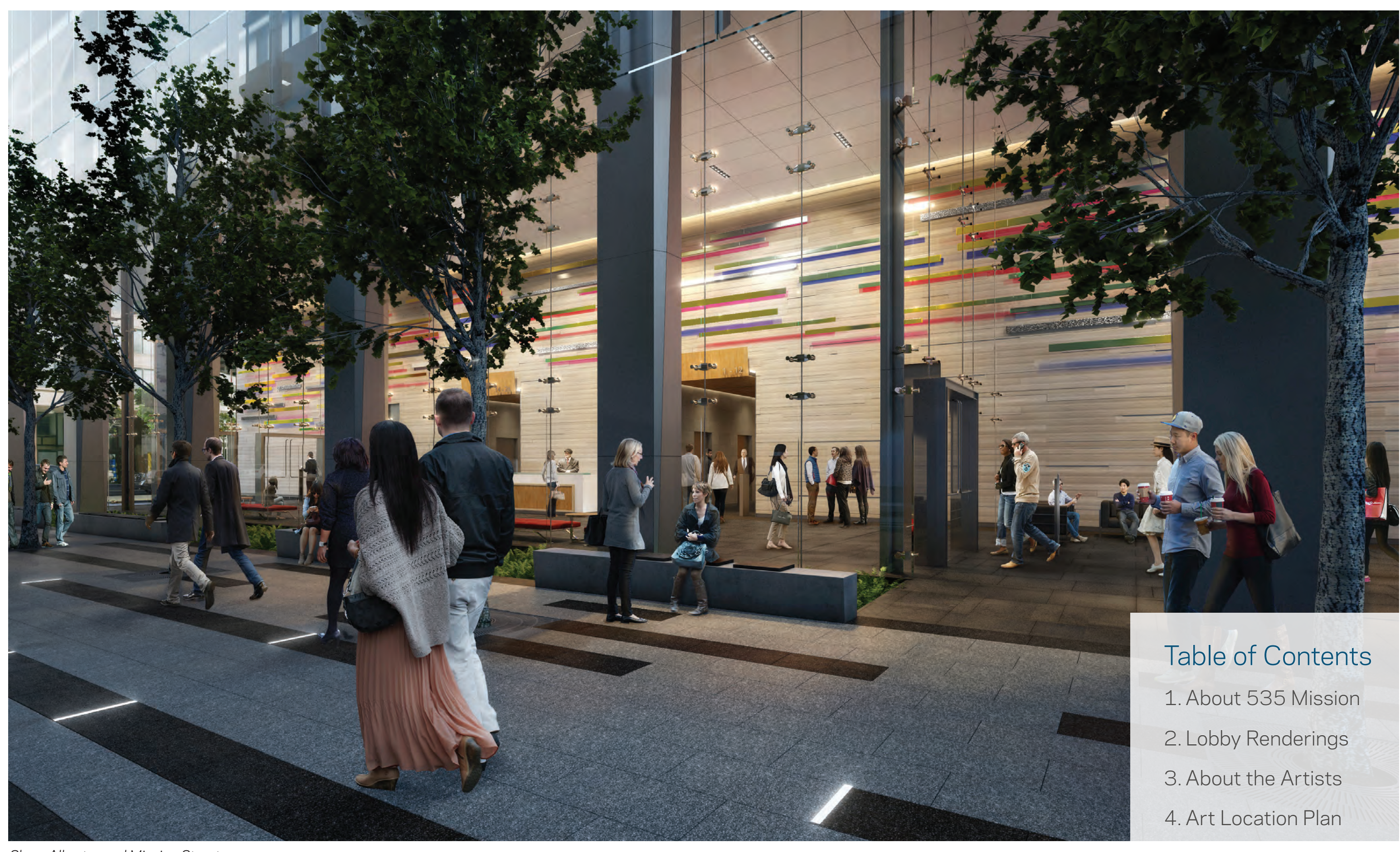
Shaw Alley toward Mission Street