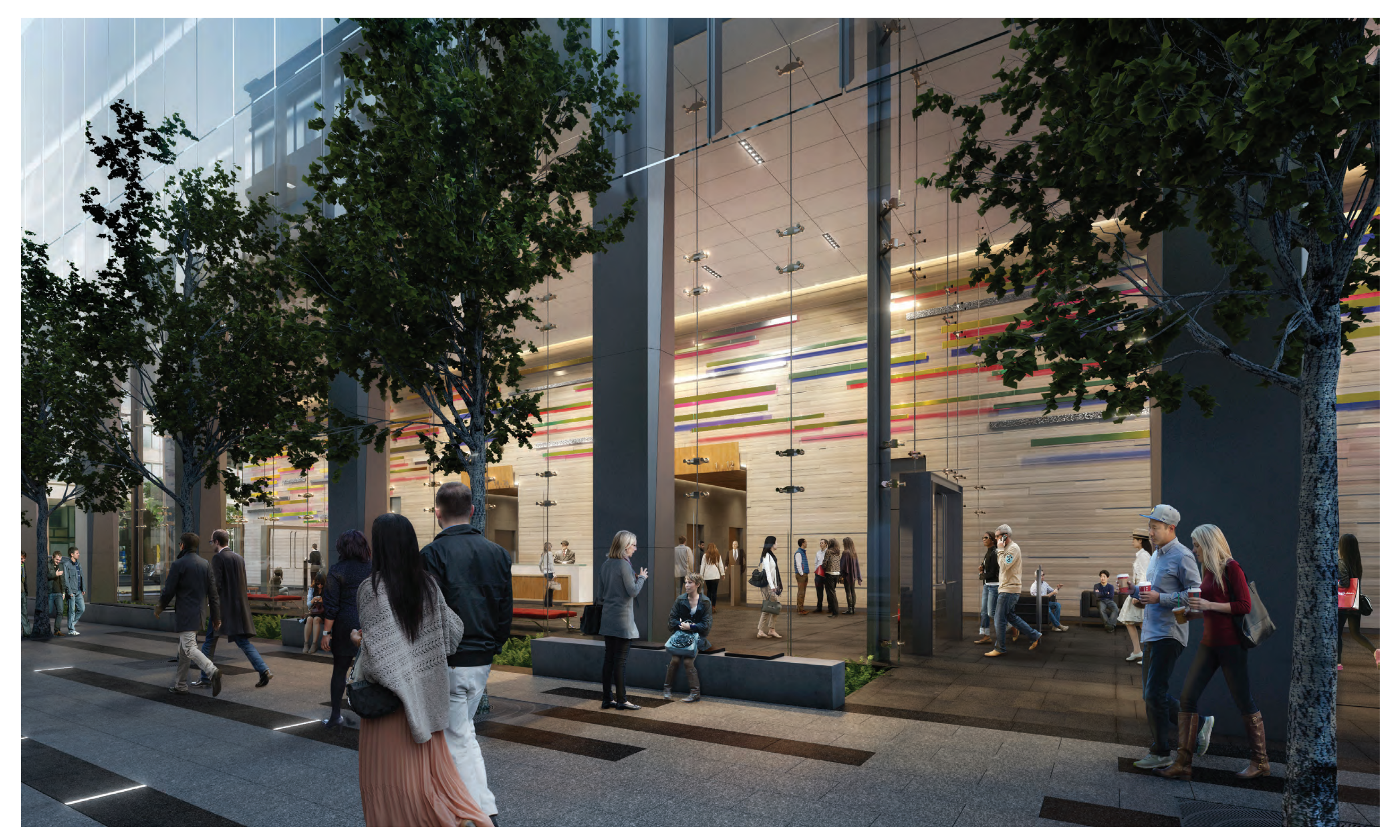
Shaw Alley toward Mission Street