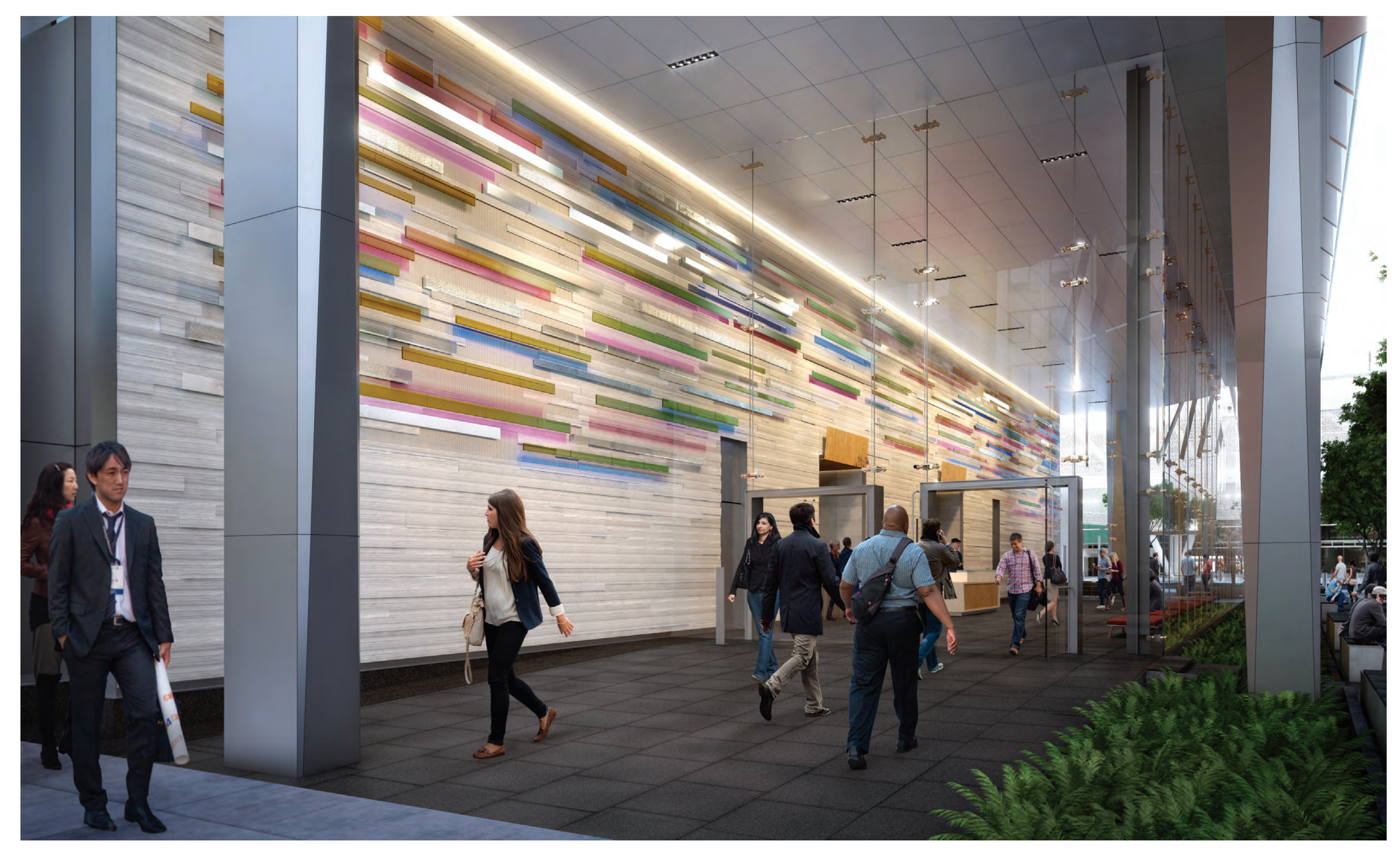
Mission Street Plaza / Building Main Entry - Gordon Huether - Applique Da Parete