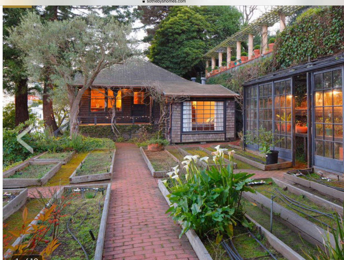
8:33 AM Wed Oct 24