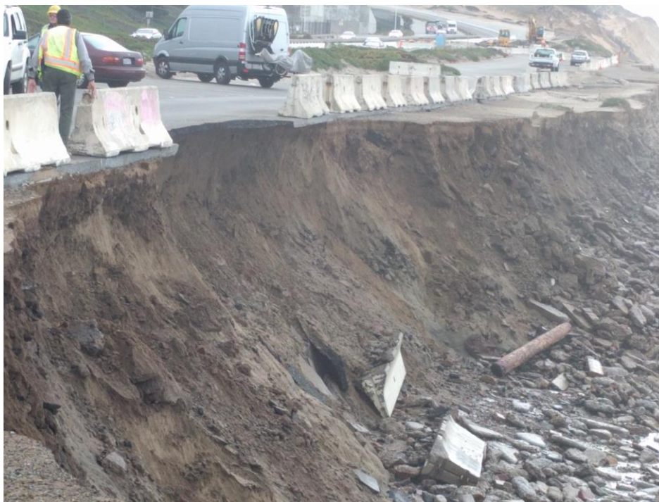
Figure 2. Eroding shoreline and rubble at South Ocean Beach, February 2016.

For over a decade, the City has explored options for a planning framework to address erosion and coastal access through the Ocean Beach Task Force and the Ocean Beach Vision Council. The San Francisco Planning and Urban Research Association (SPUR), an urban planning nonprofit organization, made substantial progress by completing the Ocean Beach Master Plan in 2012. The Master Plan represents the cooperation and involvement of the City/County and a host of federal, state, and local agencies, as well as community stakeholders in an 18-month planning process addressing seven focus areas: ecology, utility infrastructure, coastal dynamics, image and character, program and activities, access and connectivity, and management and stewardship. The proposed Local Coastal Program amendment integrates portions of the Ocean Beach Master Plan, particularly managed retreat south of Sloat Boulevard. For a rendering of proposed shoreline retreat and wastewater protection structures, see Figure 3.