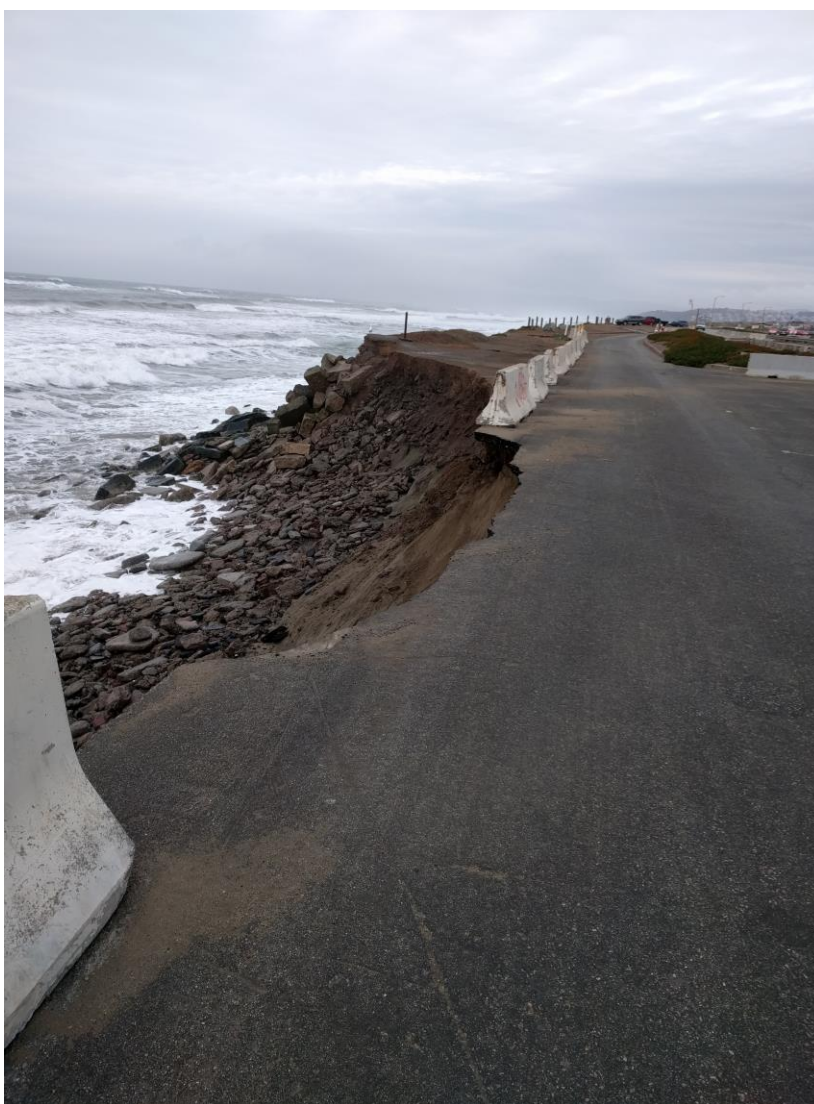
Figure 1. Conditions at South Ocean Beach, February 2016.

in 1929, the Taraval seawall in 1941, the Noriega seawall in the 1980's, and riprap revetments south of Sloat Boulevard over the past 15 years. From the late 1970's through 1993, the SFPUC constructed major sewer infrastructure at Ocean Beach, including the Oceanside Treatment Plant south of the Zoo, and the Lake Merced Tunnel and Westside Transport Box beneath the Great Highway. Sand has been placed on the beach since the 1970's, and the northern and middle reaches of the beach are stable, but erosion of south Ocean Beach has damaged the Great Highway, resulted in the loss of beach parking, and threatens to damage critical wastewater system infrastructure. See Figures 1 and 2 for current shoreline conditions and erosion at South Ocean Beach. Sea level rise and the increased frequency and severity of coastal storms anticipated due to global climate change will likely exacerbate these effects in the decades to come.