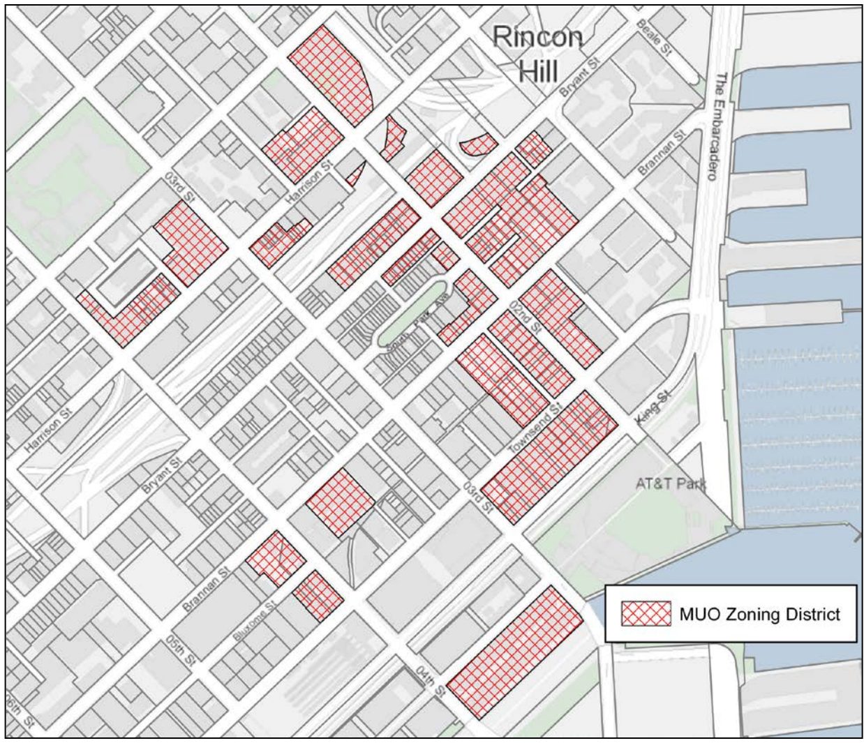
This zoning map shows the location of the MUO Zoning District within the SoMa area.

Height designations within the MUO range from 45' to 130', with the majority of the parcels mapped at 65'. The highest height designation – 130' – is limited to the east, and a portion of the west, sides of 2^{nd} Street between Harrison and Folsom Streets. The 105' height designation is located on the block bounded by 2^{nd} , 3^{rd} , Townsend, and King Streets, across from AT&T Park. On this block, there is a parcel located at 144 King Street, for which a hotel that is greater than 75 rooms has been proposed.